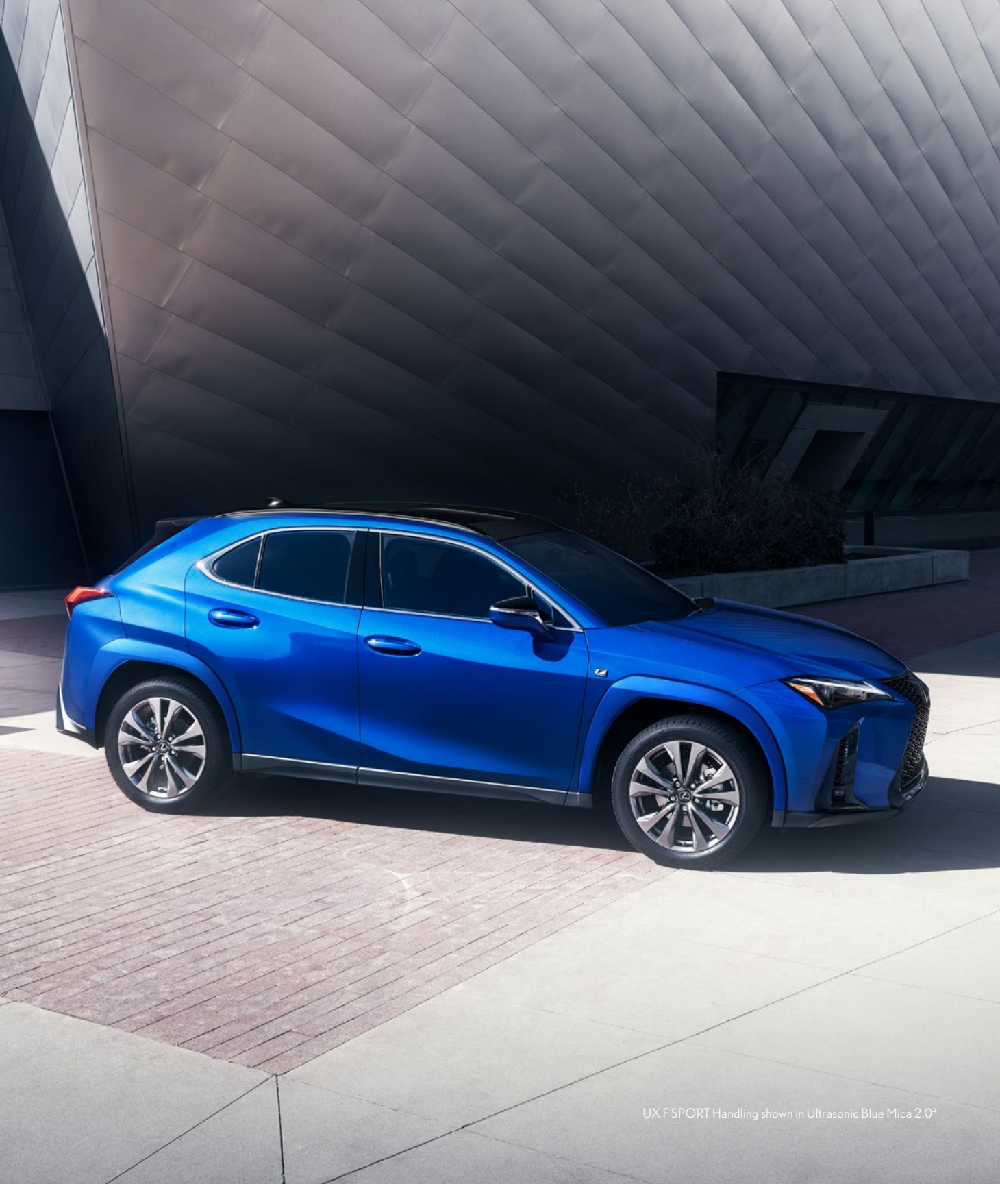
UX F SPORT Handling shown in Ultrasonic Blue Mica 2.0 4