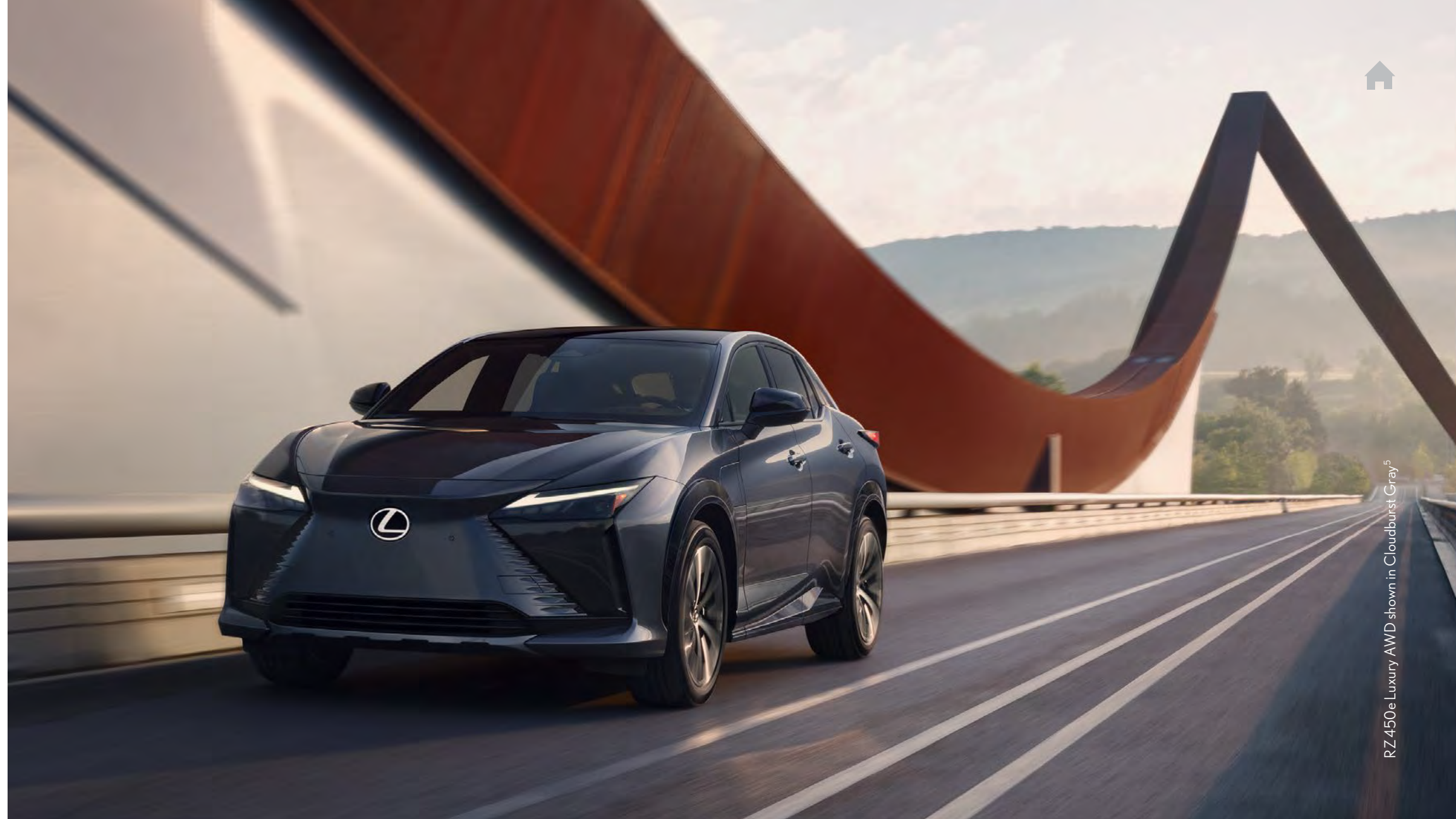
RZ 450e Luxury AWD shown in Cloudburst Gray 5