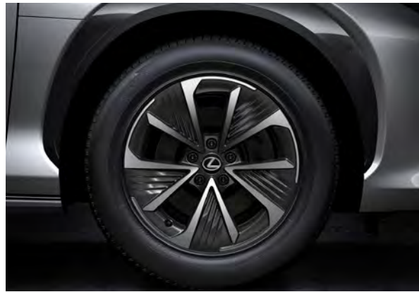
18-in Five-spoke alloy wheels with Dark Gray Metallic and machined finish STANDARD RZ, RZ Premium