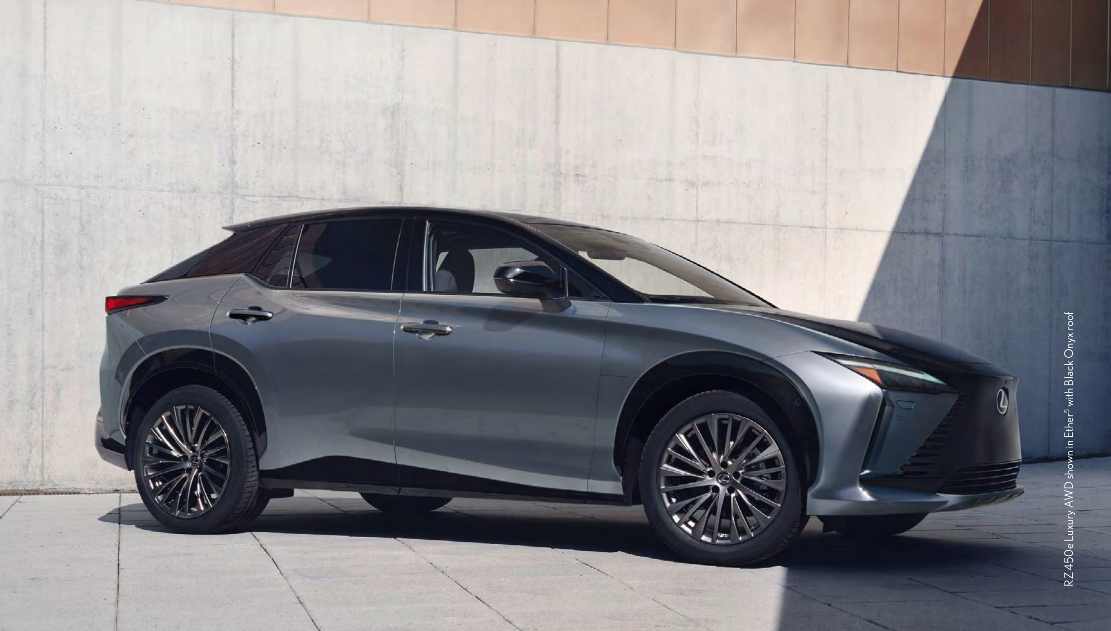
RZ 450e Luxury AWD shown in Ether 5 with Black Onyx roof