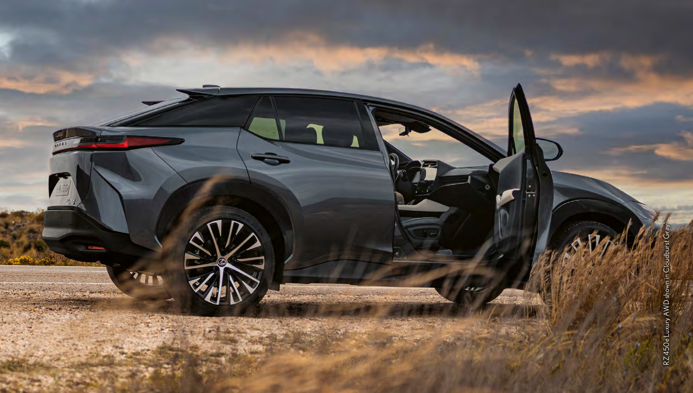
RZ 450e Luxury AWD shown in Cloudburst Gray 5