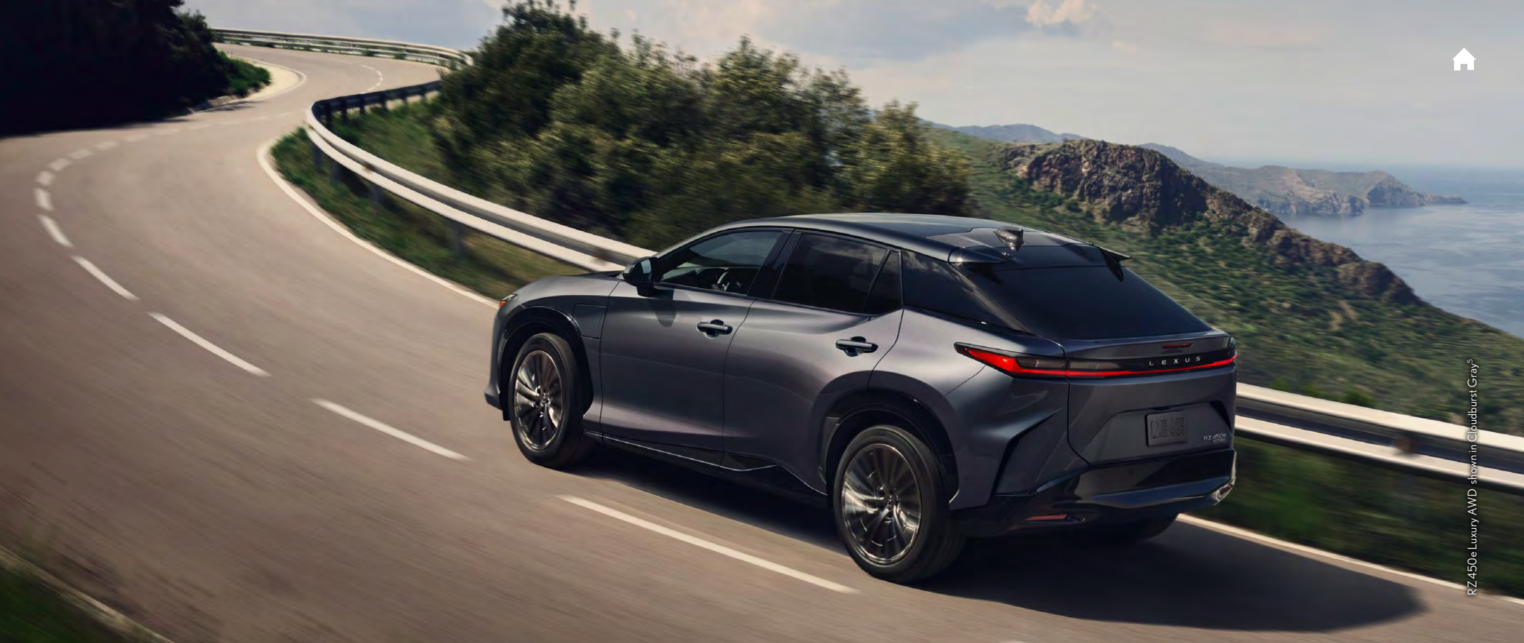
RZ 450e Luxury AWD shown in Cloudburst Gray 5