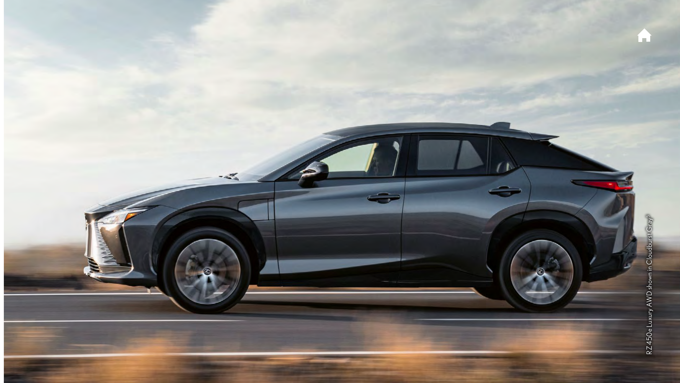
RZ 450e Luxury AWD shown in Cloudburst Gray 5