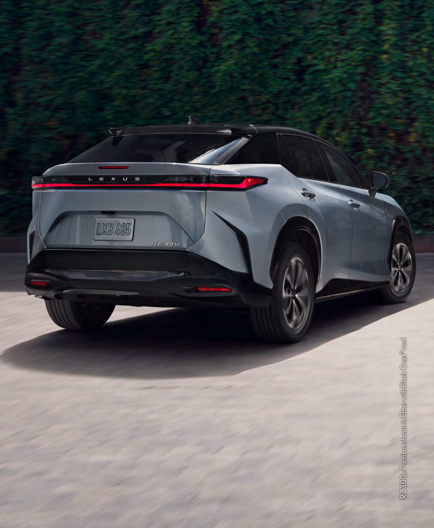
RZ300e Premium shown in Ether with Black Onyx 3 roof

RZ 300e / RZ 300e PREMIUM / RZ 300e LUXURY