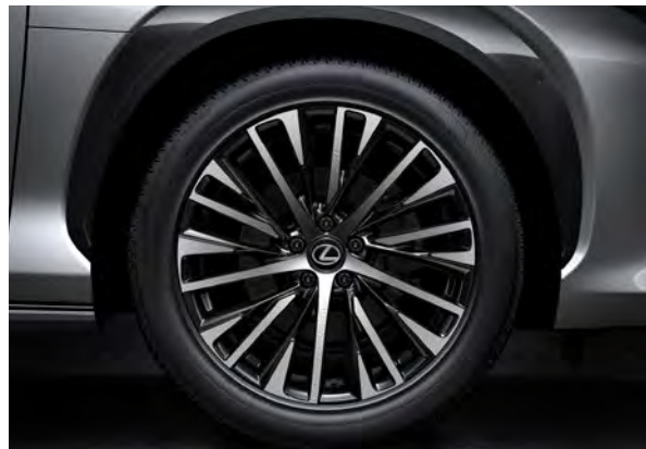
20-in 10-spoke alloy wheels with Black and machined finish STANDARD RZ Luxury AVAILABLE RZ Premium