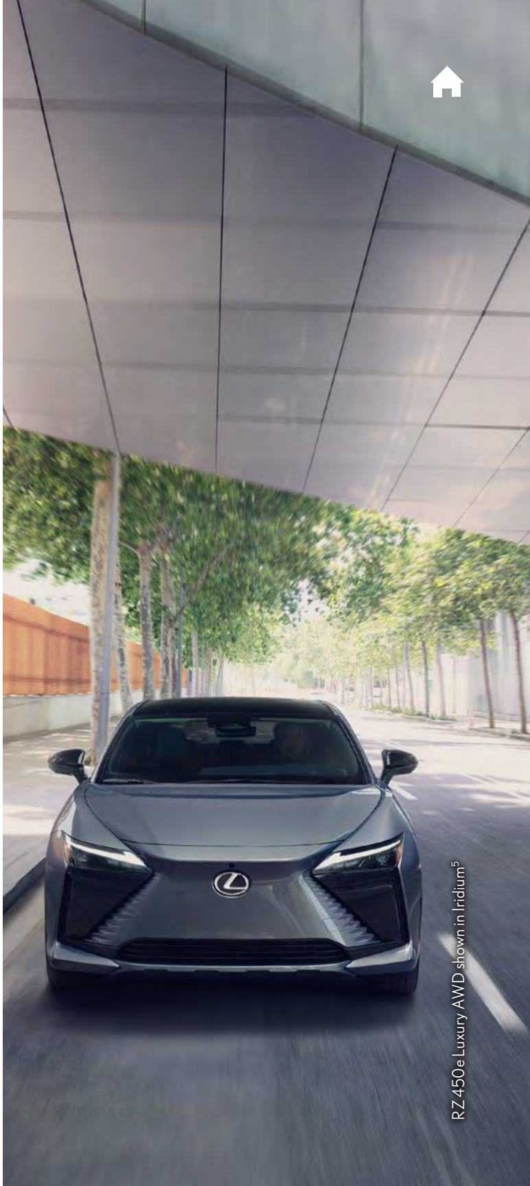
RZ 450e Luxury AWD shown in Iridium 5

View all standard features and configure your RZ at lexus.com/build/RZ . Availability is limited. See your Lexus dealer for details.