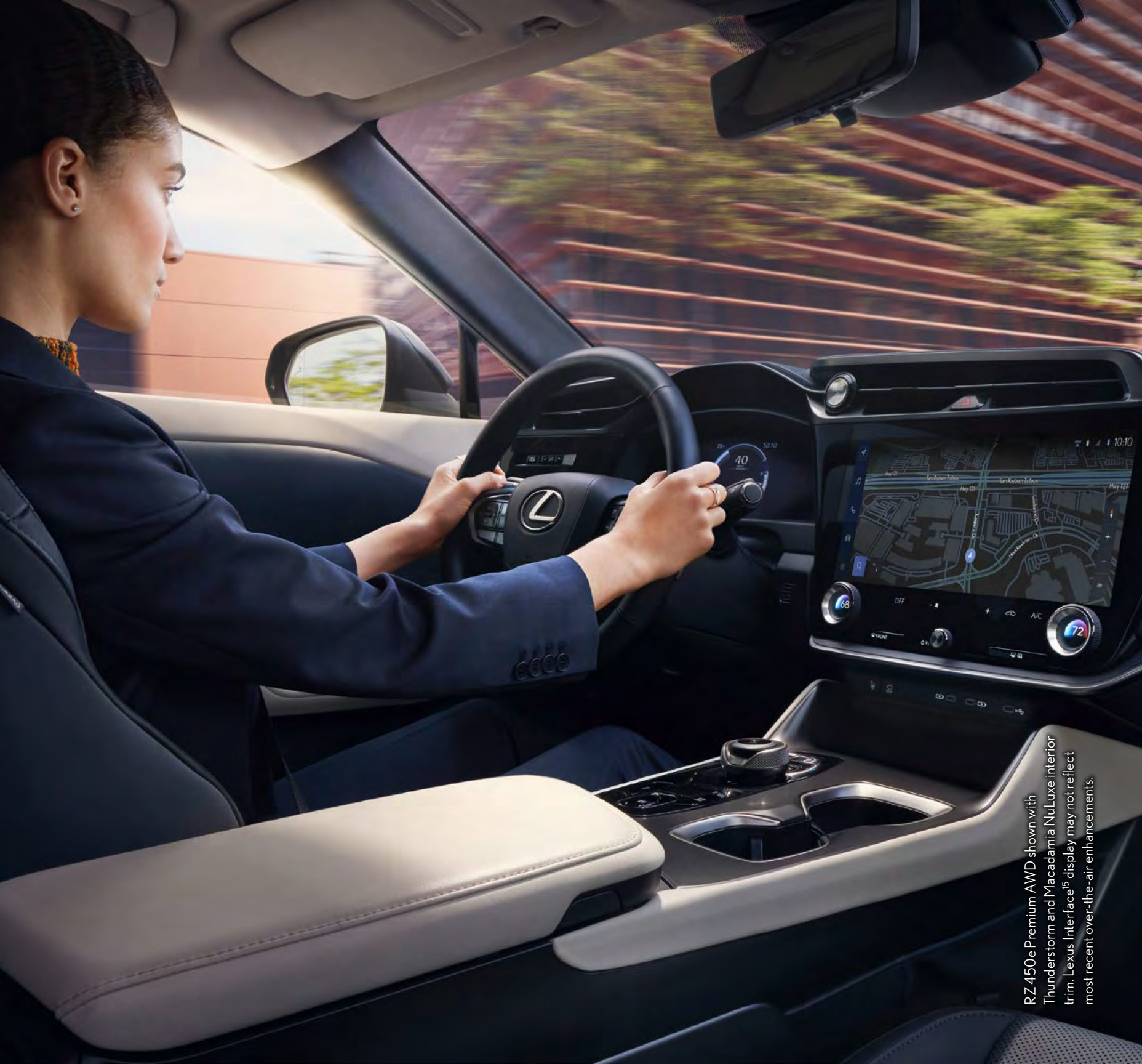
RZ 450e Premium AWD shown with Thunderstorm and Macadamia NuLuxe interior trim. Lexus Interface 15 display may not reflect most recent over-the-air enhancements.