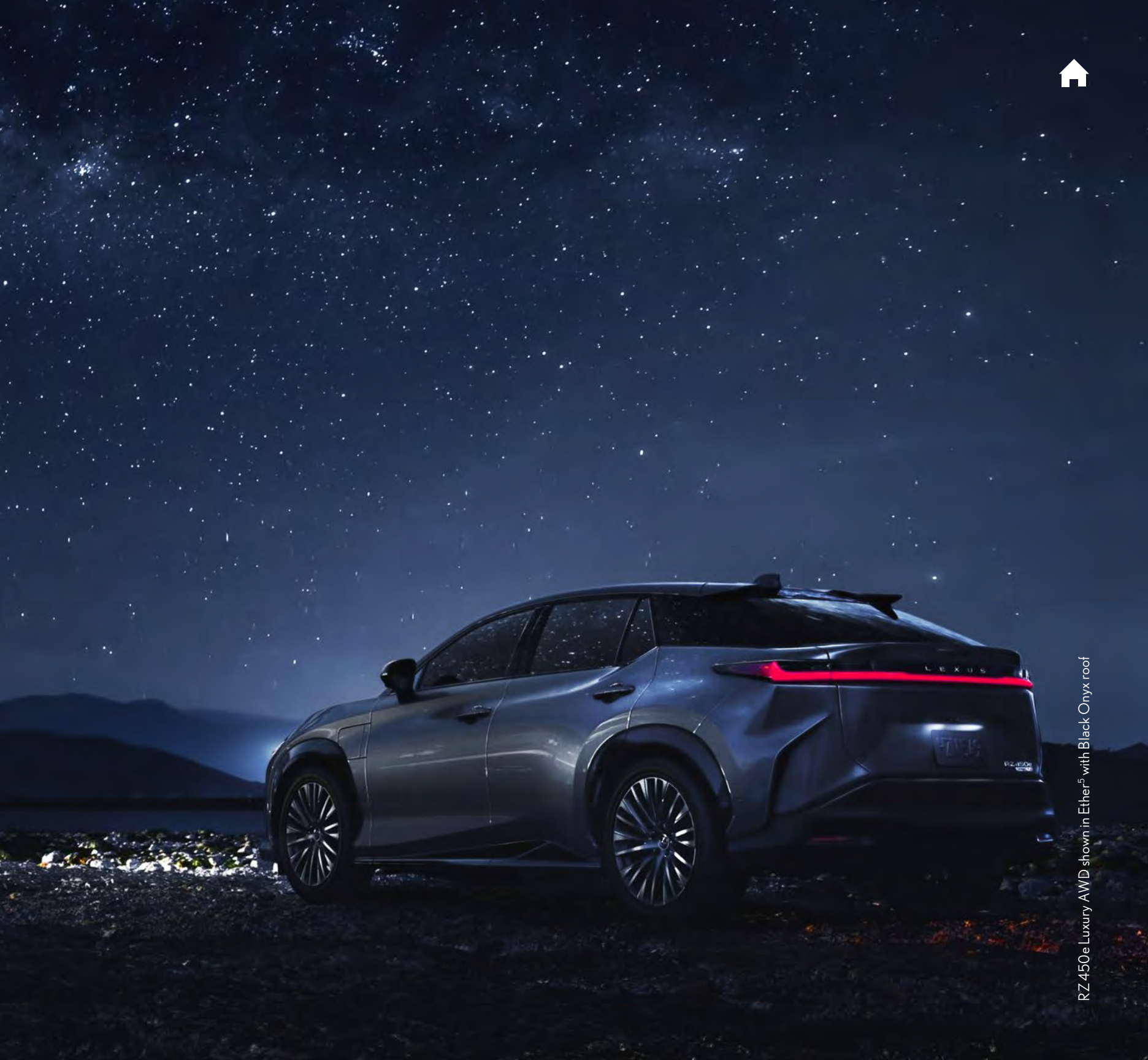
RZ 450e Luxury AWD shown in Ether 5 with Black Onyx roof