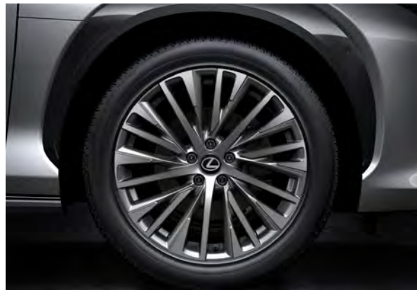
20-in 10-spoke alloy wheels with Gray Metallic finish AVAILABLE RZ Luxury