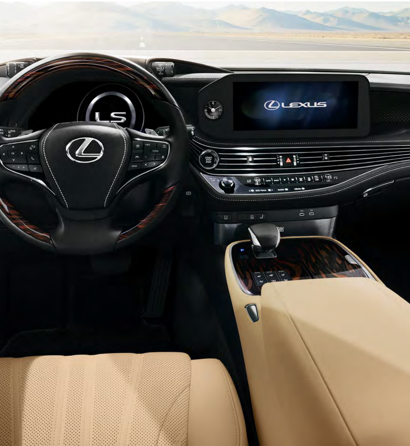
LS shown with Palomino leather and Artwood Organic Gloss interior trim