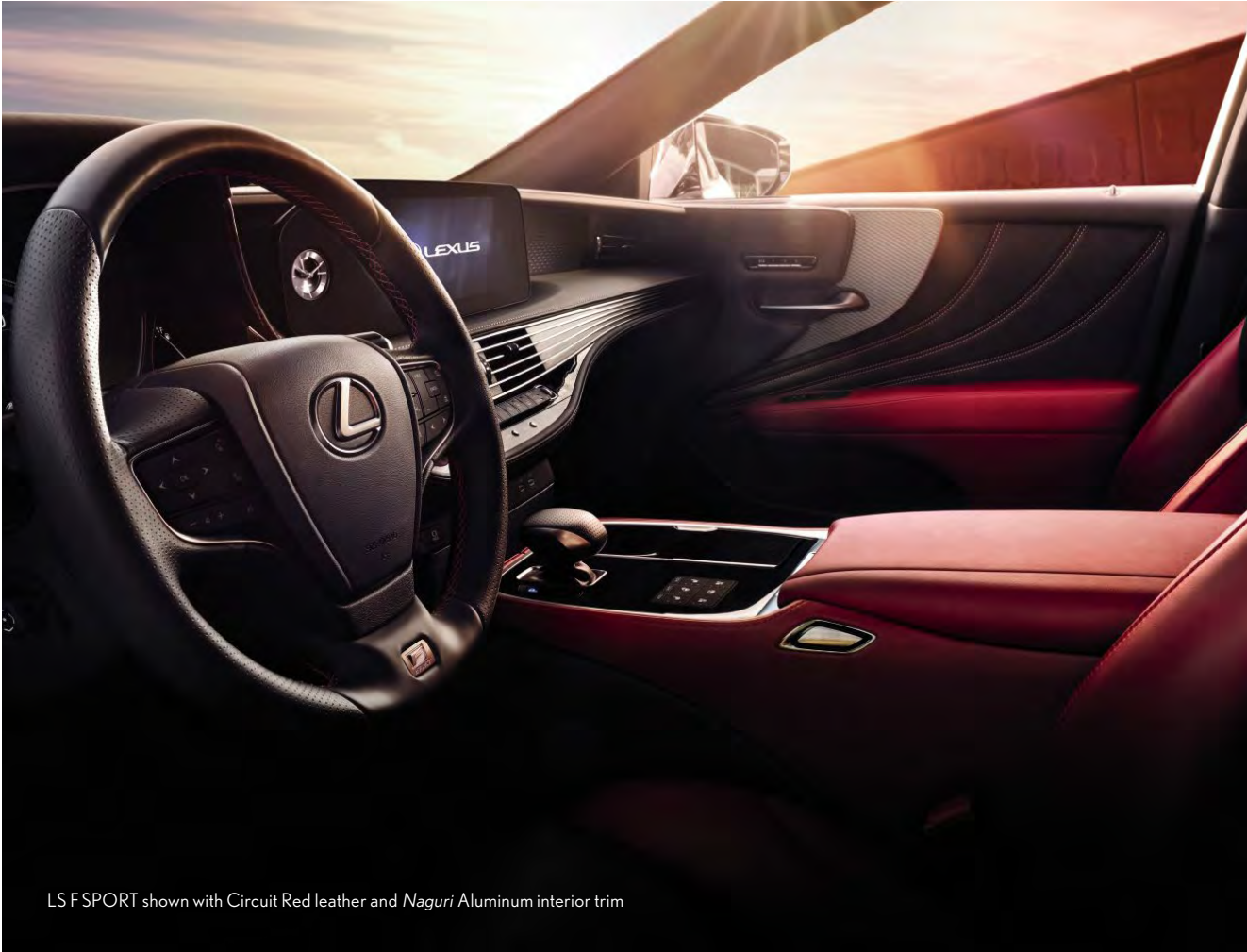
LS F SPORT shown with Circuit Red leather and Naguri Aluminum interior trim