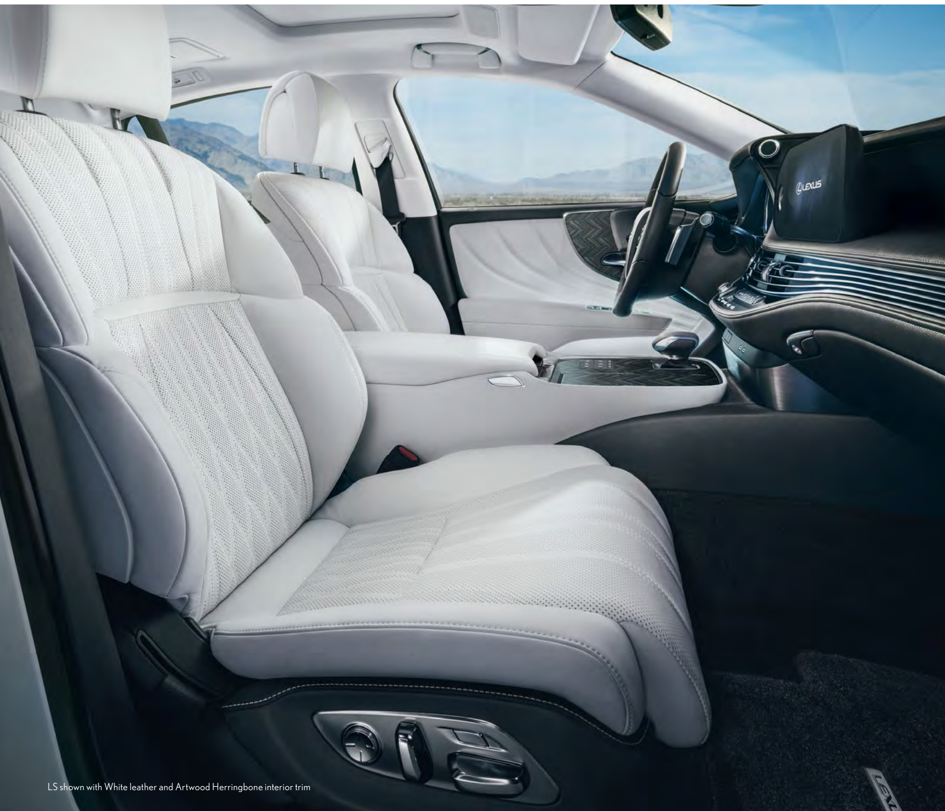
LS shown with White leather and Artwood Herringbone interior trim