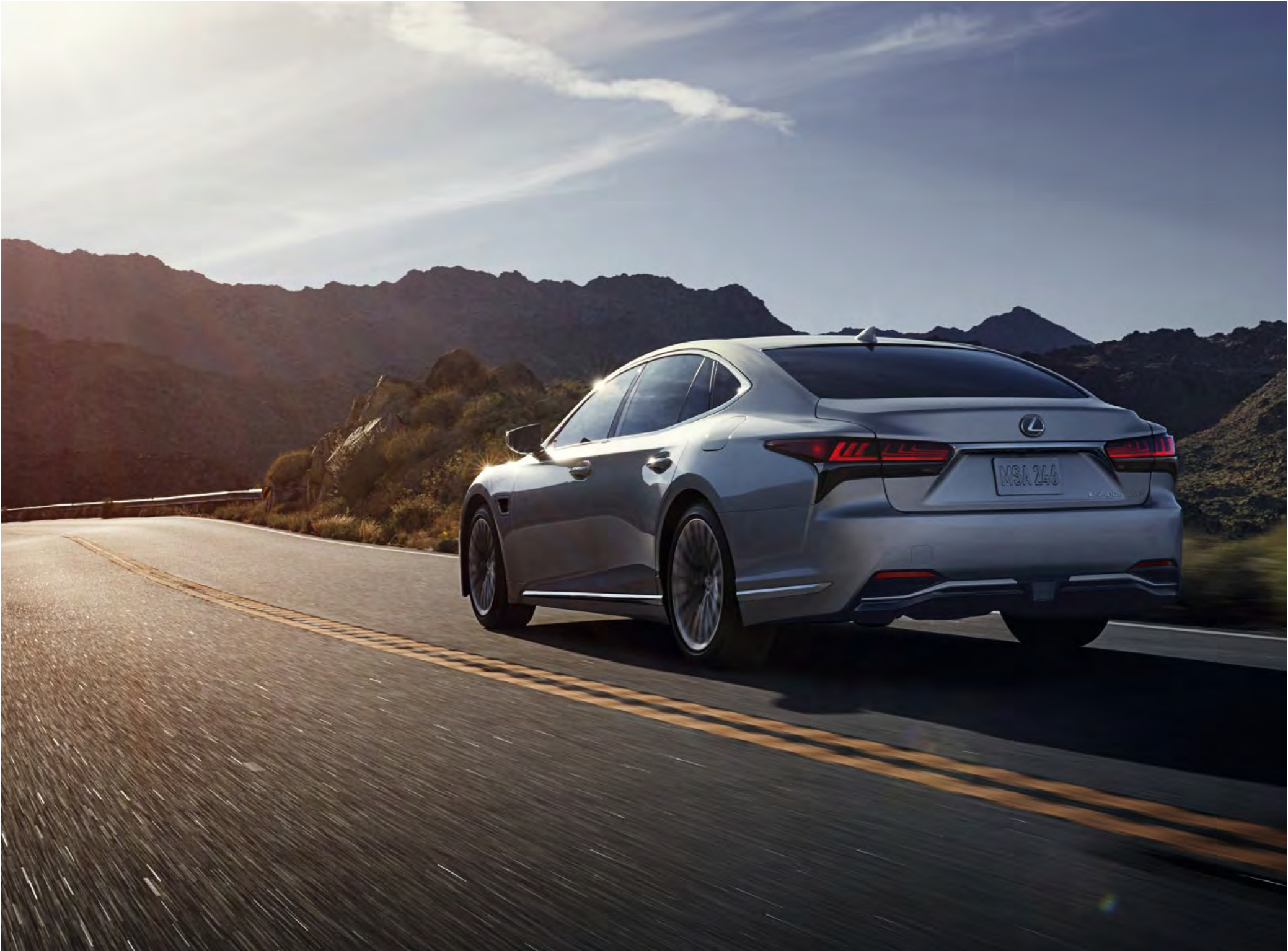
LSh shown in Atomic Silver

Crafted to deliver exceptional refinement, power and response, the LS 500h AWD is the definitive multistage hybrid prestige luxury sedan. Its advanced powertrain pairs a 3.5-liter V6 with powerful electric motors and a compact lithium-ion battery to deliver a potent 354 net combined horsepower. 2 And with its intelligent all-wheel drive system and next-generation driver-assistance technology, the LS 500h AWD continues to define the entire concept of excellence in the category.