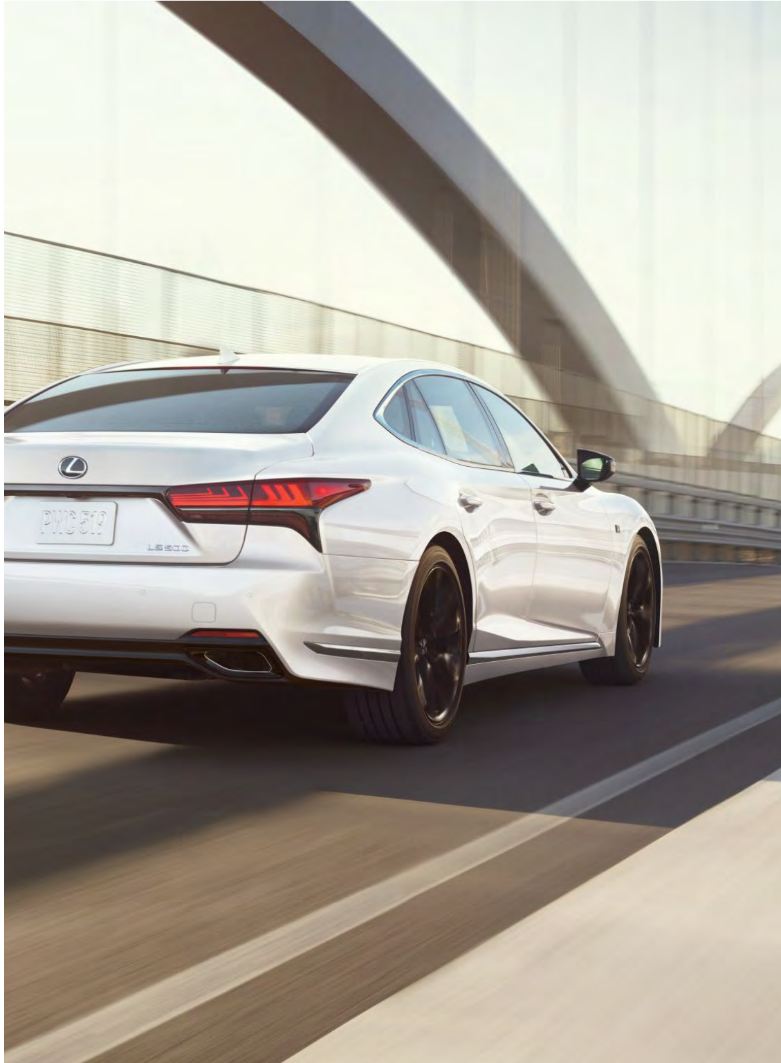
LS F SPORT shown in Ultra White 3