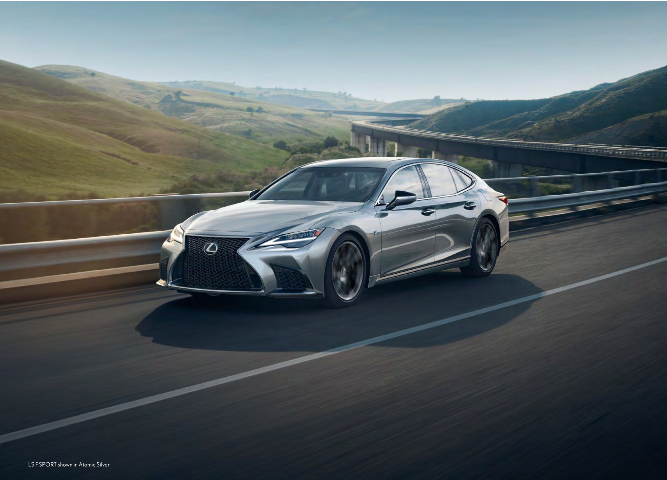
LS F SPORT shown in Atomic Silver