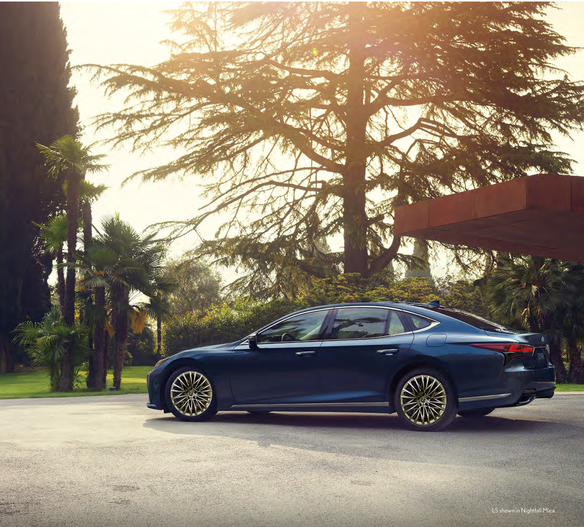
LS shown in Nightfall Mica

Split-10-spoke alloy wheels with Ultra Dark Gray Metallic finish STANDARD LS F SPORT