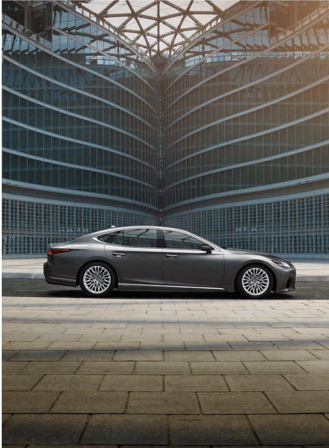
LS shown in Manganese Luster 3