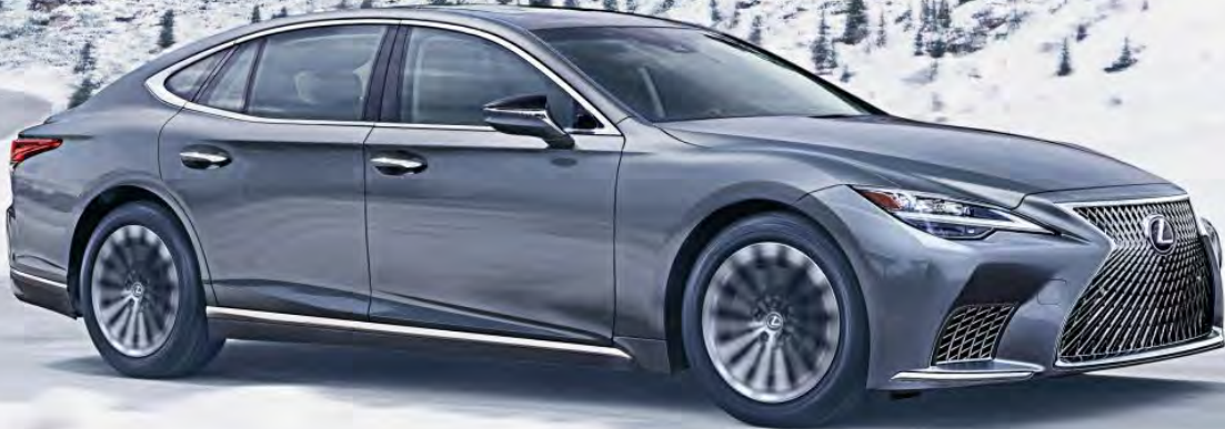
LS AWD shown in Manganese Luster 3

Never sacrifice style for capability with all-wheel drive, available on all LS models. Full-time all-wheel drive delivers engine power to all four wheels, and a Torsen ®32 limited-slip center differential efficiently distributes it between the front and rear axles, helping optimize traction, handling and control in a variety of driving conditions.