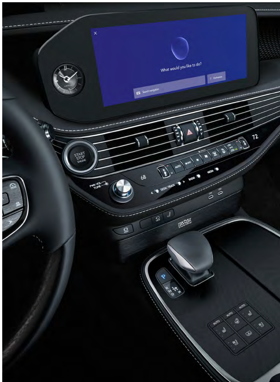
LS shown with Black leather and Kiriko Glass interior trim