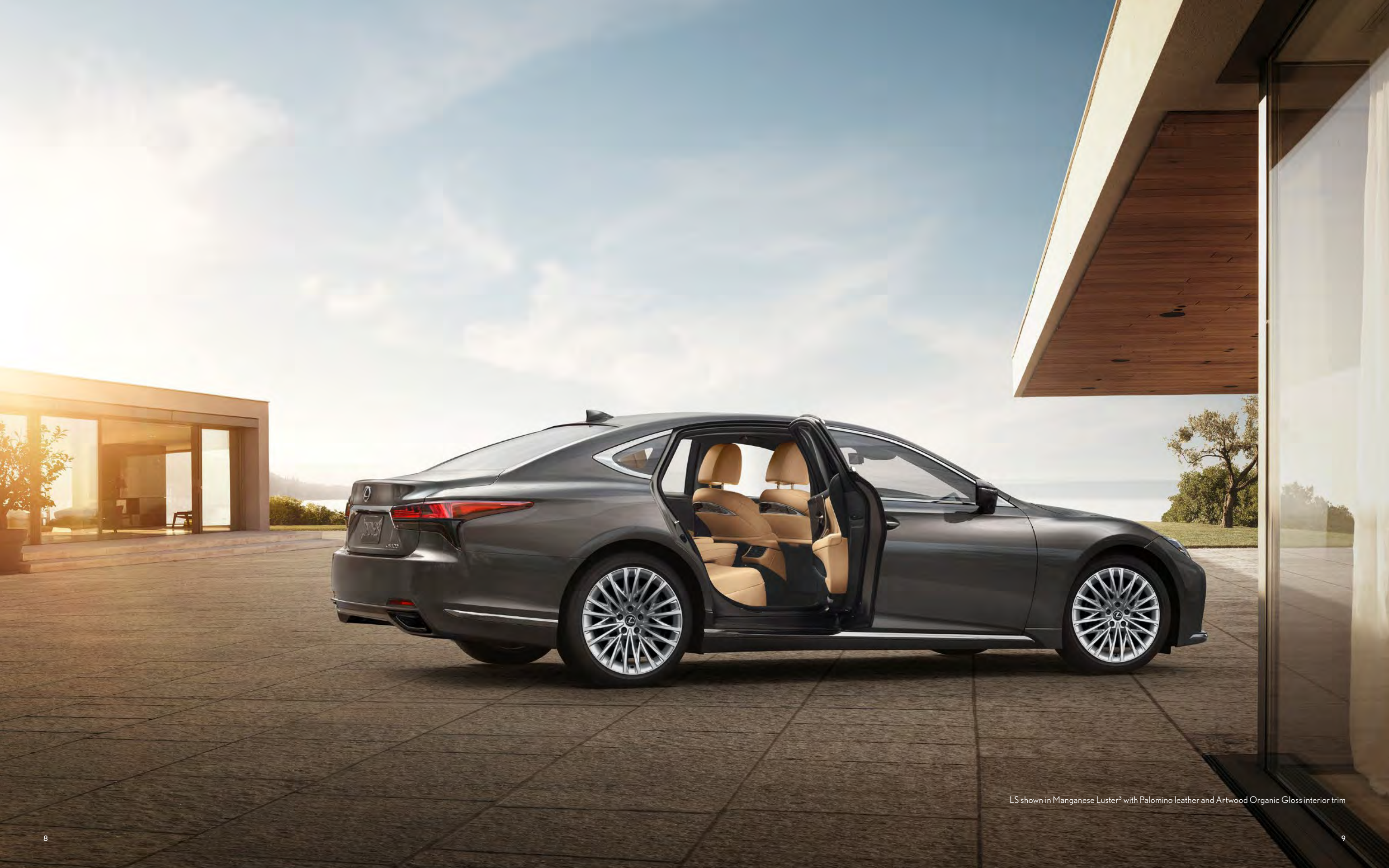
LS shown in Manganese Luster 3 with Palomino leather and Artwood Organic Gloss interior trim