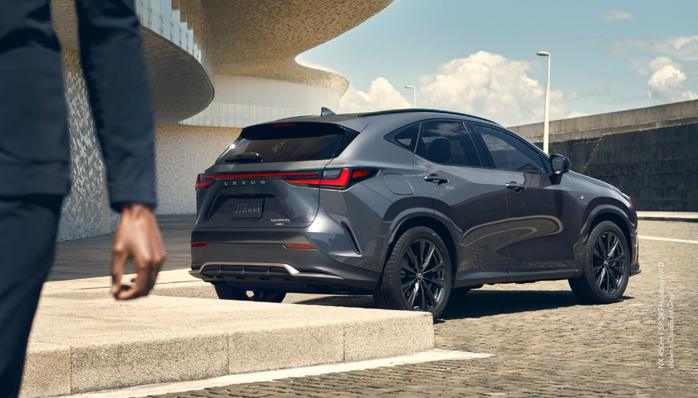
NX 450h+ F SPORT Handling AWD shown in Cloudburst Gray*