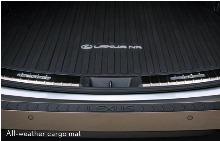
All-weather cargo mat