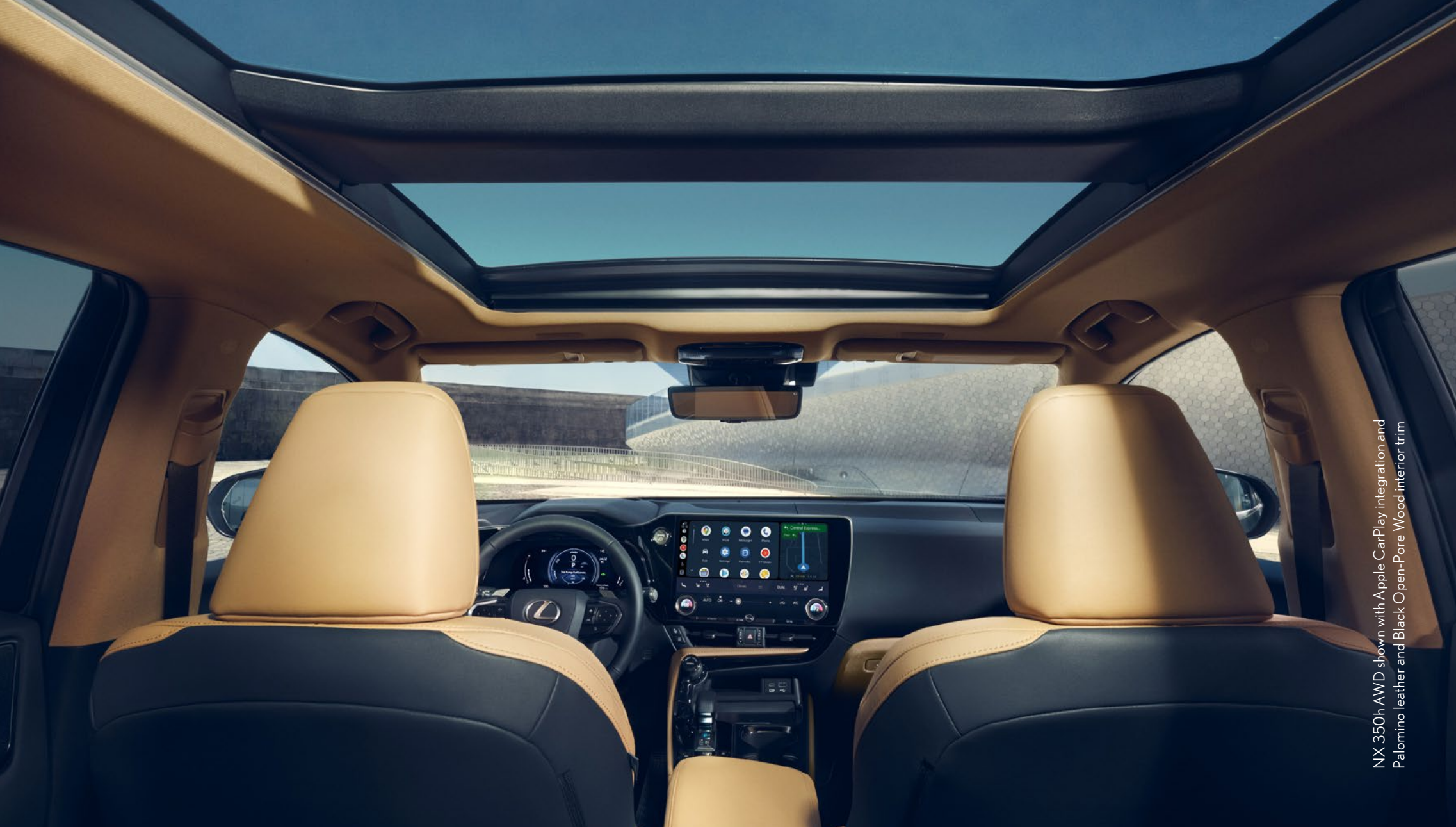
NX 350h AWD shown with Apple CarPlay integration and Palomino leather and Black Open-Pore Wood interior trim