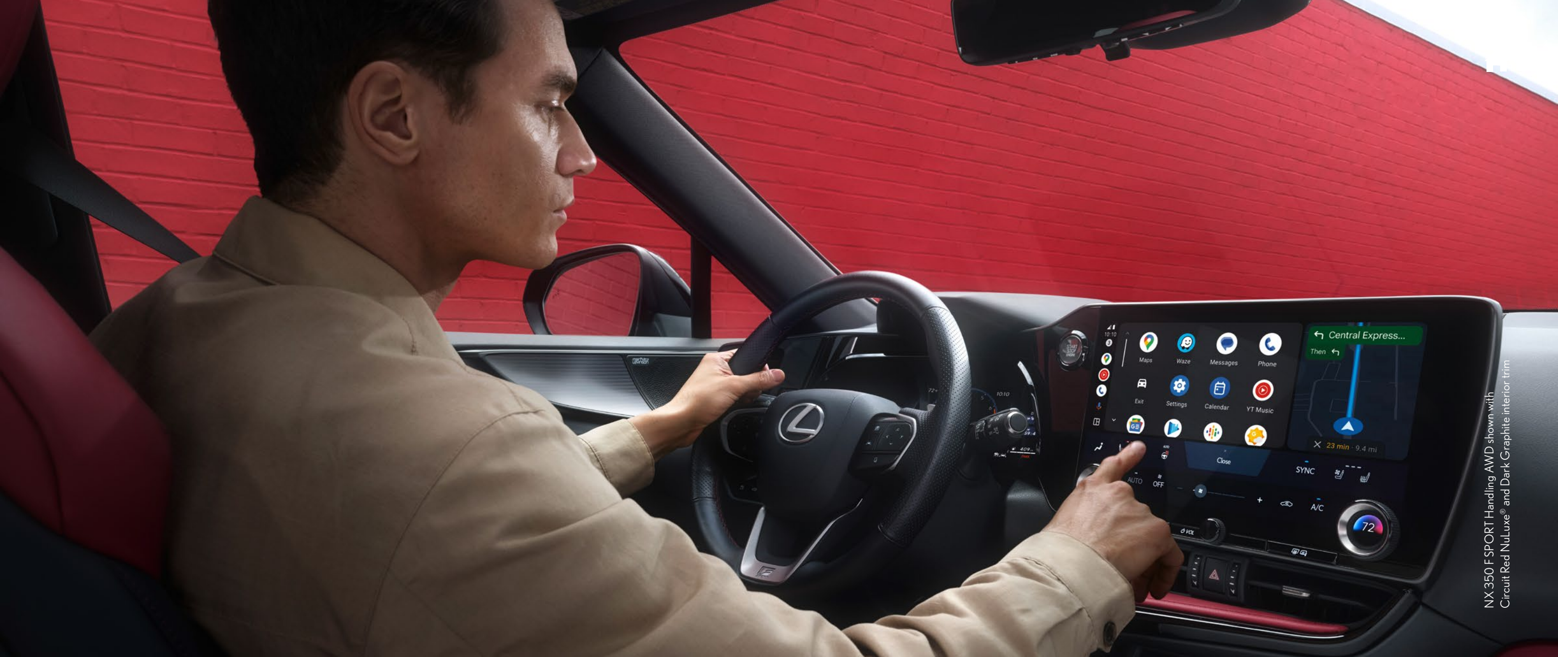
NX 350 F SPORT Handling AWD shown with Circuit Red NuLuxe® and Dark Graphite interior trim