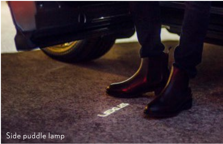
Side puddle lamp