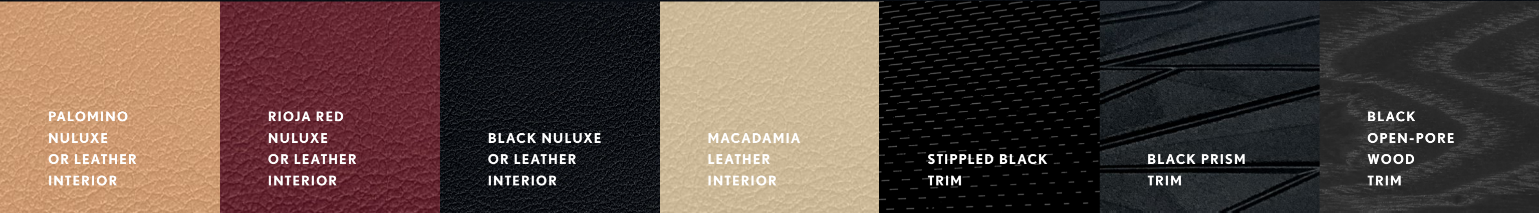
PALOMINO NULUXE OR LEATHER INTERIOR