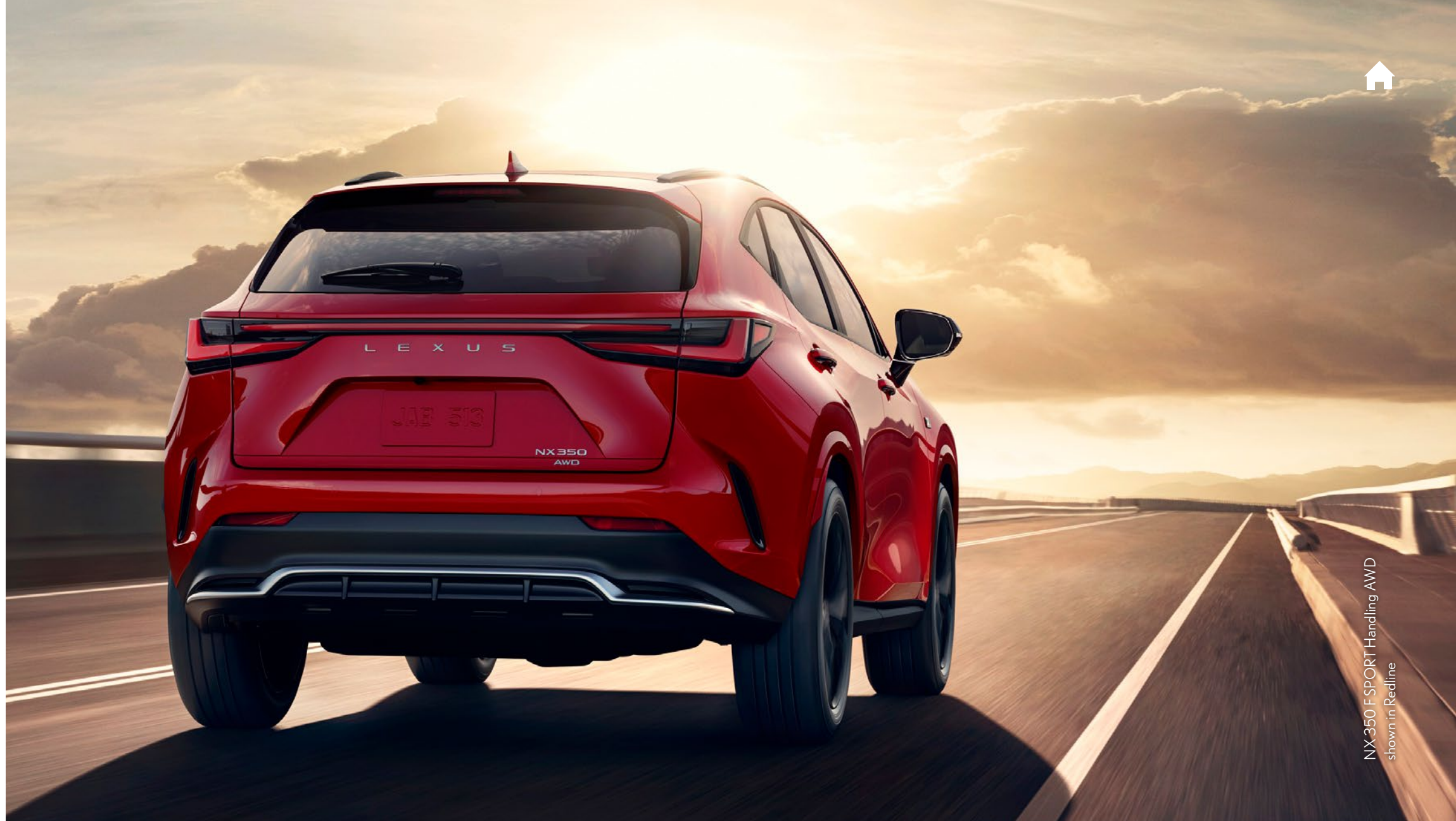
NX 350 F SPORT Handling AWD shown in Redline