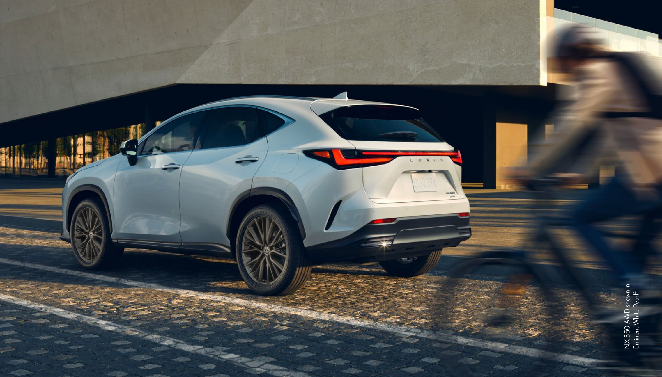
NX 350 AWD shown in Eminent White Pearl 4