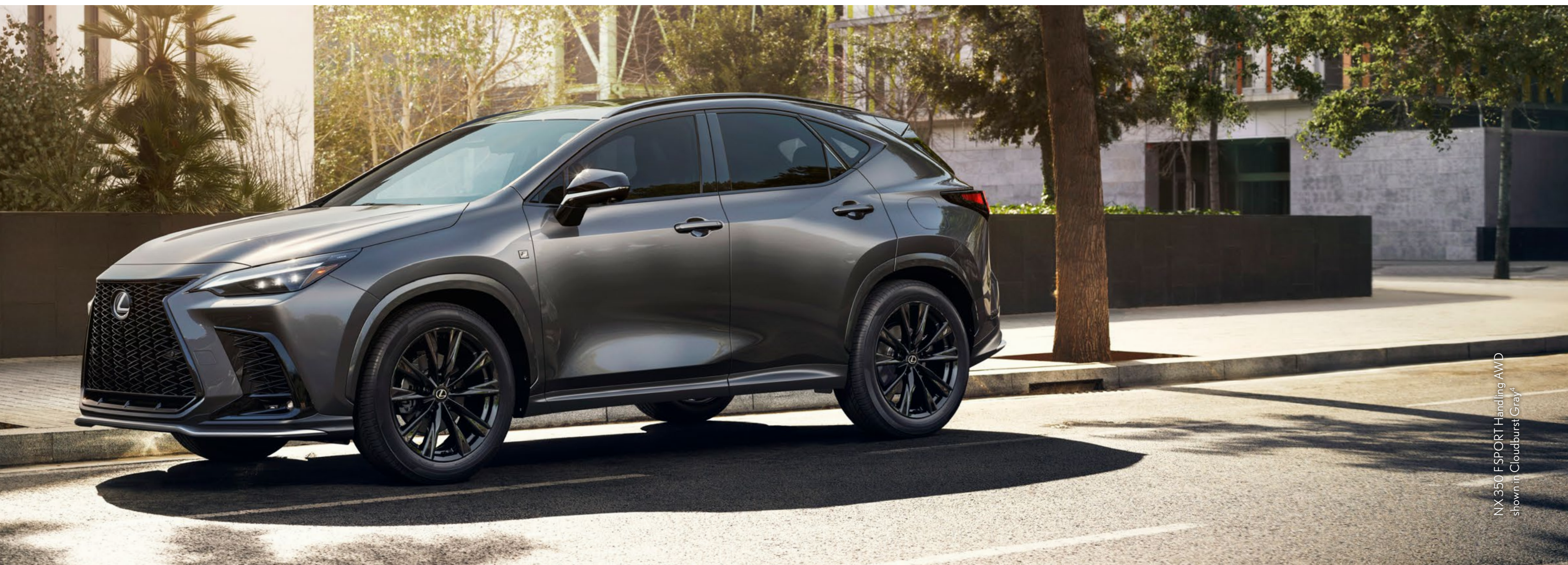
NX 350 F SPORT Handling AWD shown in Cloudburst Gray 4

Split-five-spoke alloy wheels with Black finish STANDARD F SPORT Handling