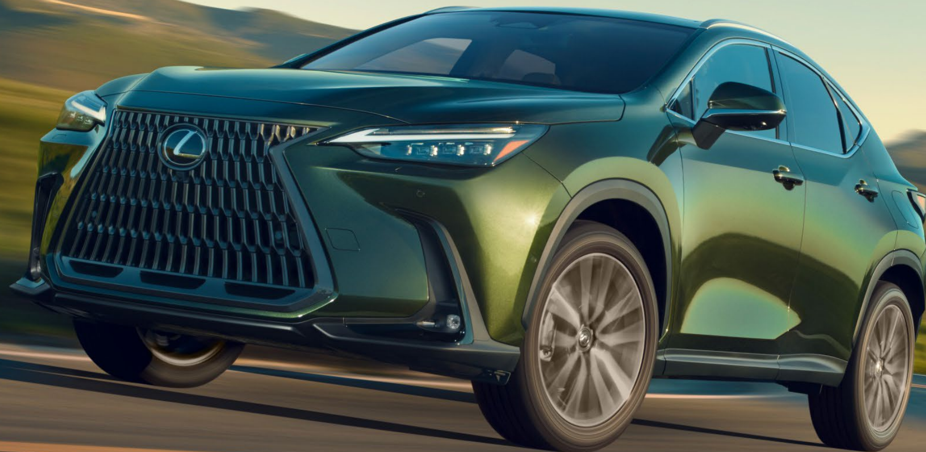
NX 350h AWD shown in Nori Green Pearl