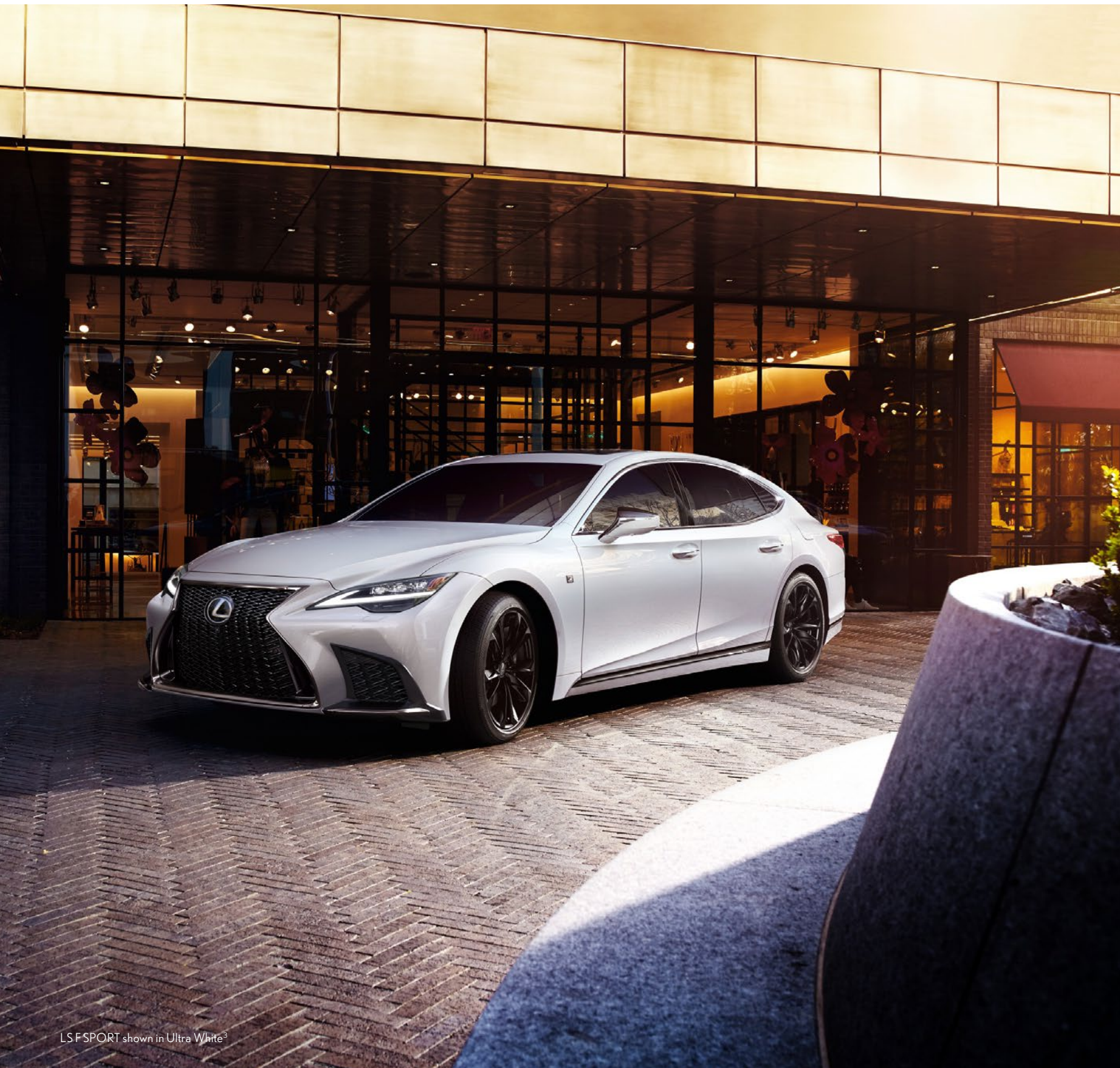
LS500 shown in Ultra White 3