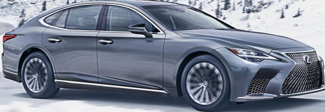
LS AWD shown in Manganese Luster 3

Never sacrifice style for capability with all-wheel drive, available on all LS models. Full-time all-wheel drive delivers engine power to all four wheels, and a Torsen ®31 limited-slip center differential efficiently distributes it between the front and rear axles, helping optimize traction, handling and control in a variety of driving conditions.