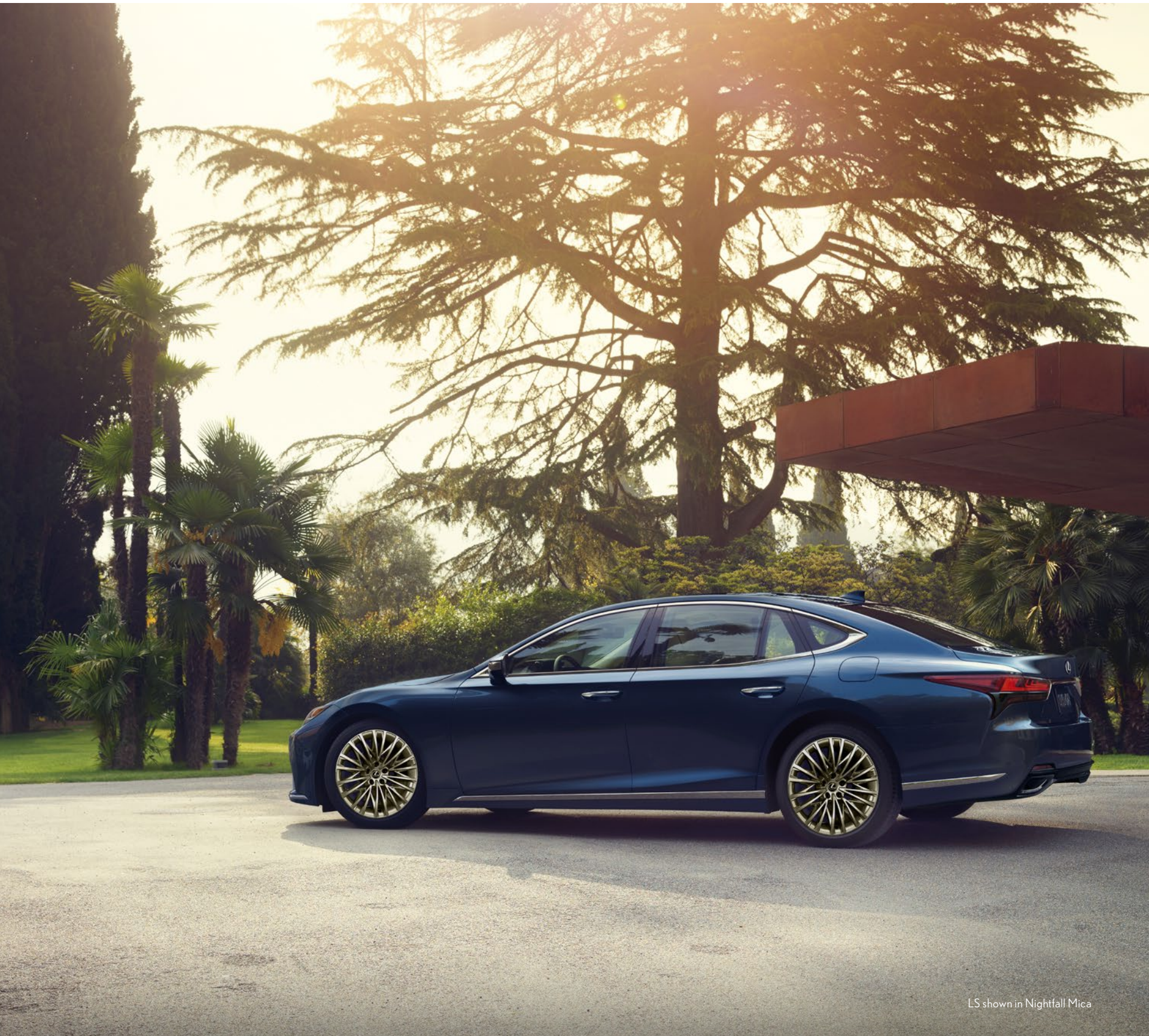
LS shown in Nightfall Mica

20-inch split-10-spoke alloy F SPORT wheels with Ultra Dark Gray Metallic finish STANDARD LS F SPORT