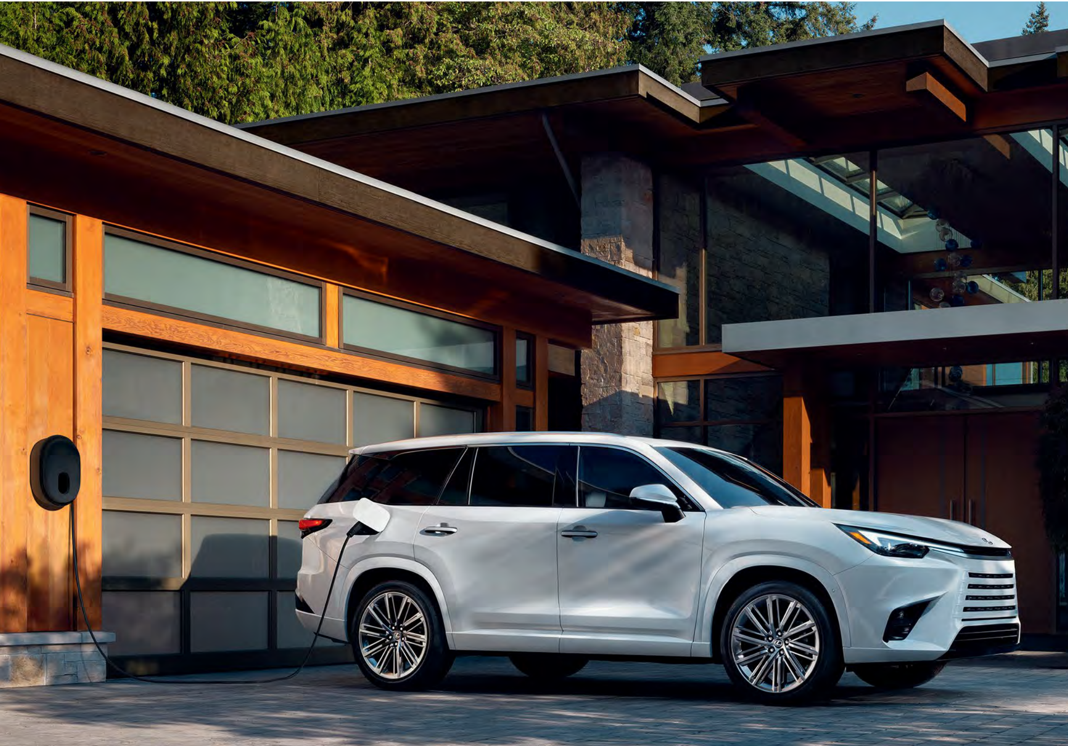
TX 500h+ Luxury shown in Wind Chill Pearl