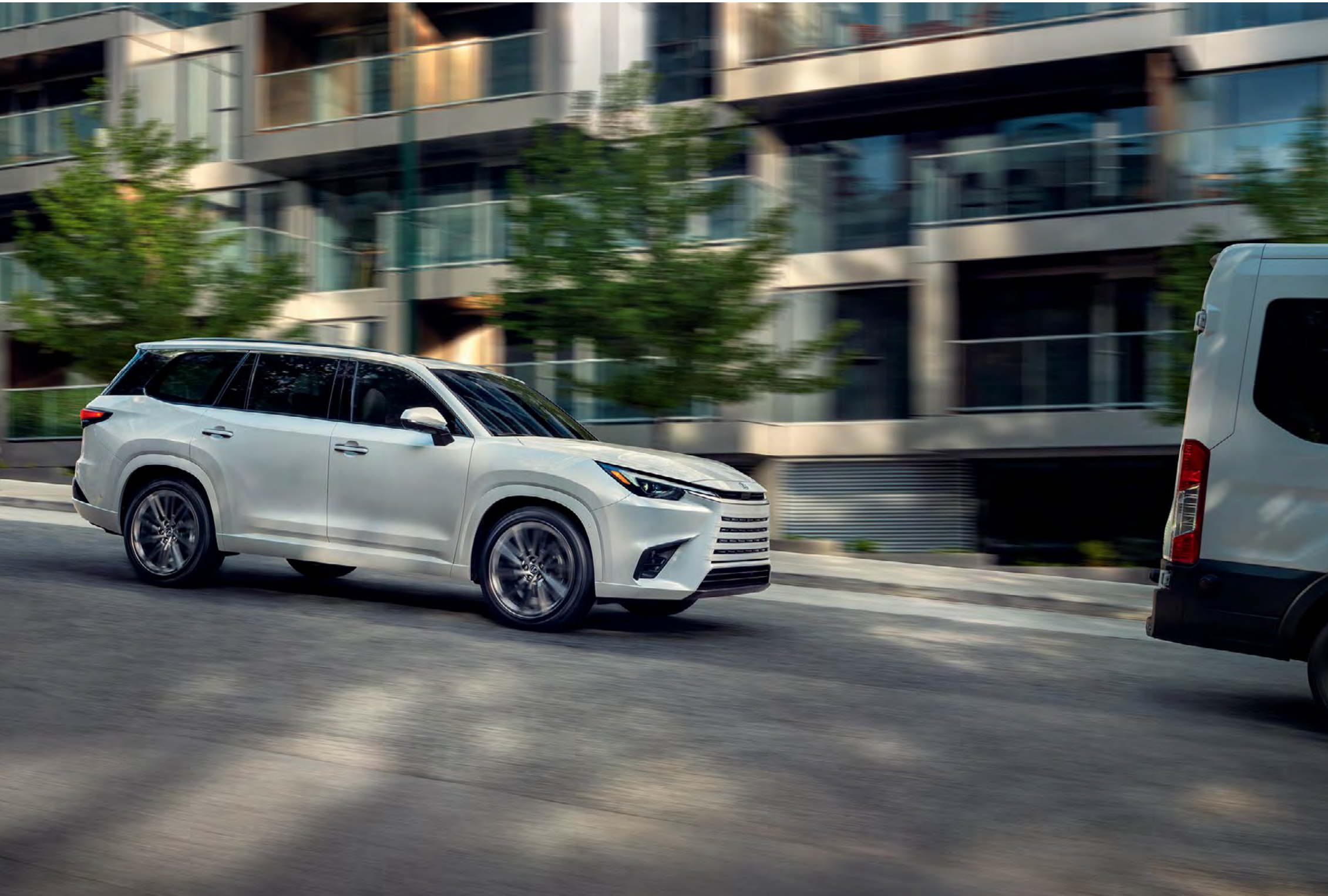
TX 350 Luxury AWD shown with options in Wind Chill Pearl