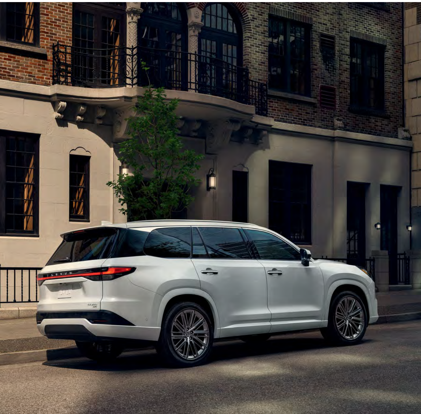
TX 350 Luxury AWD shown with options in Wind Chill Pearl