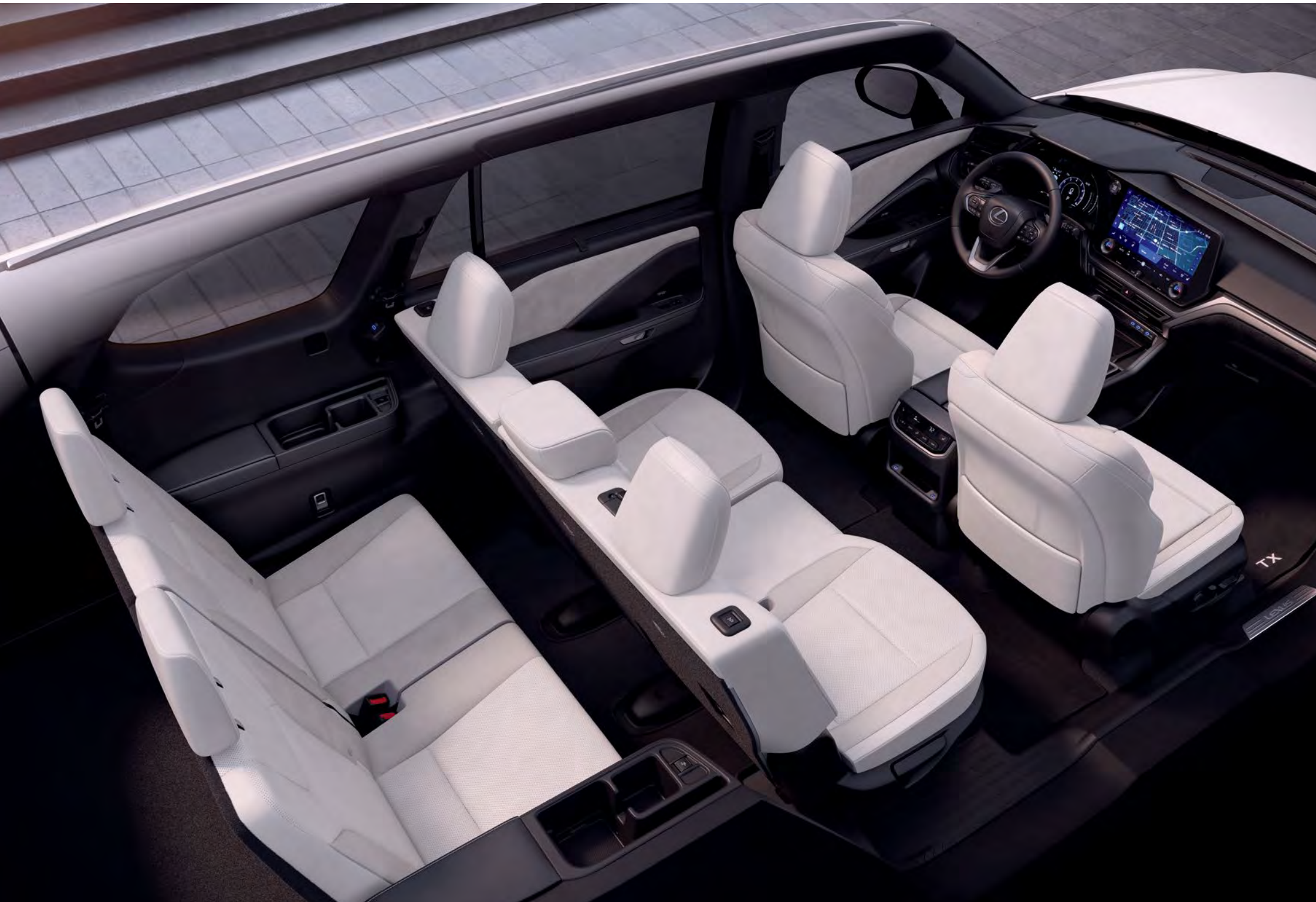
TX 350 Luxury shown with Birch semi-aniline leather and Black Grained interior trim