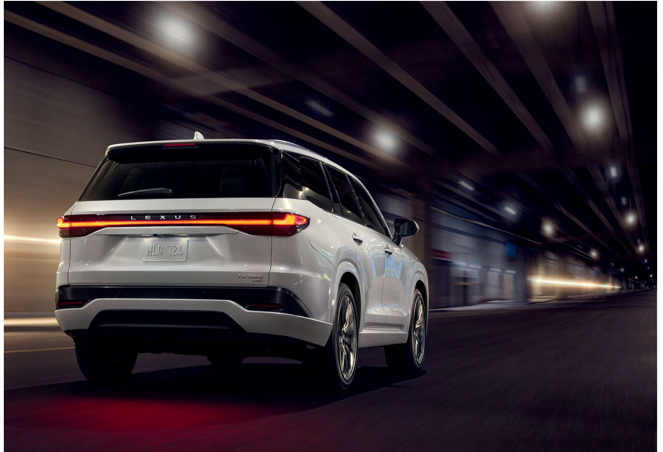
TX 350 Luxury AWD shown in Wind Chill Pearl

— This is where impeccable engineering meets intuitive response. Powering the TX 350 is a 2.4-liter turbocharged in-line 4-cylinder engine rated at 275 horsepower. 1 Its flat torque curve helps you more easily access its 317 lb-ft of torque 1 to give you the passing power you need, when you need it. For added confidence in almost any weather, available electronically controlled full-time all-wheel drive doesn't just handle the road—it reacts to it. Monitoring surface conditions in real time, this system can automatically shift engine power between the front and rear axles of the TX, and can send as much as 50% of available drive force to the rear wheels when needed.