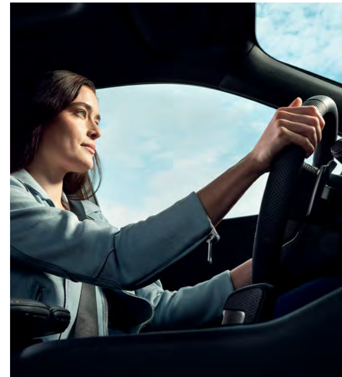
TX 500h F SPORT Performance Luxury shown in Incognito

Offering three distinct powertrains, available all-wheel drive and a towing capacity of 5,000 pounds, the TX is ready to help you take command of every road trip.