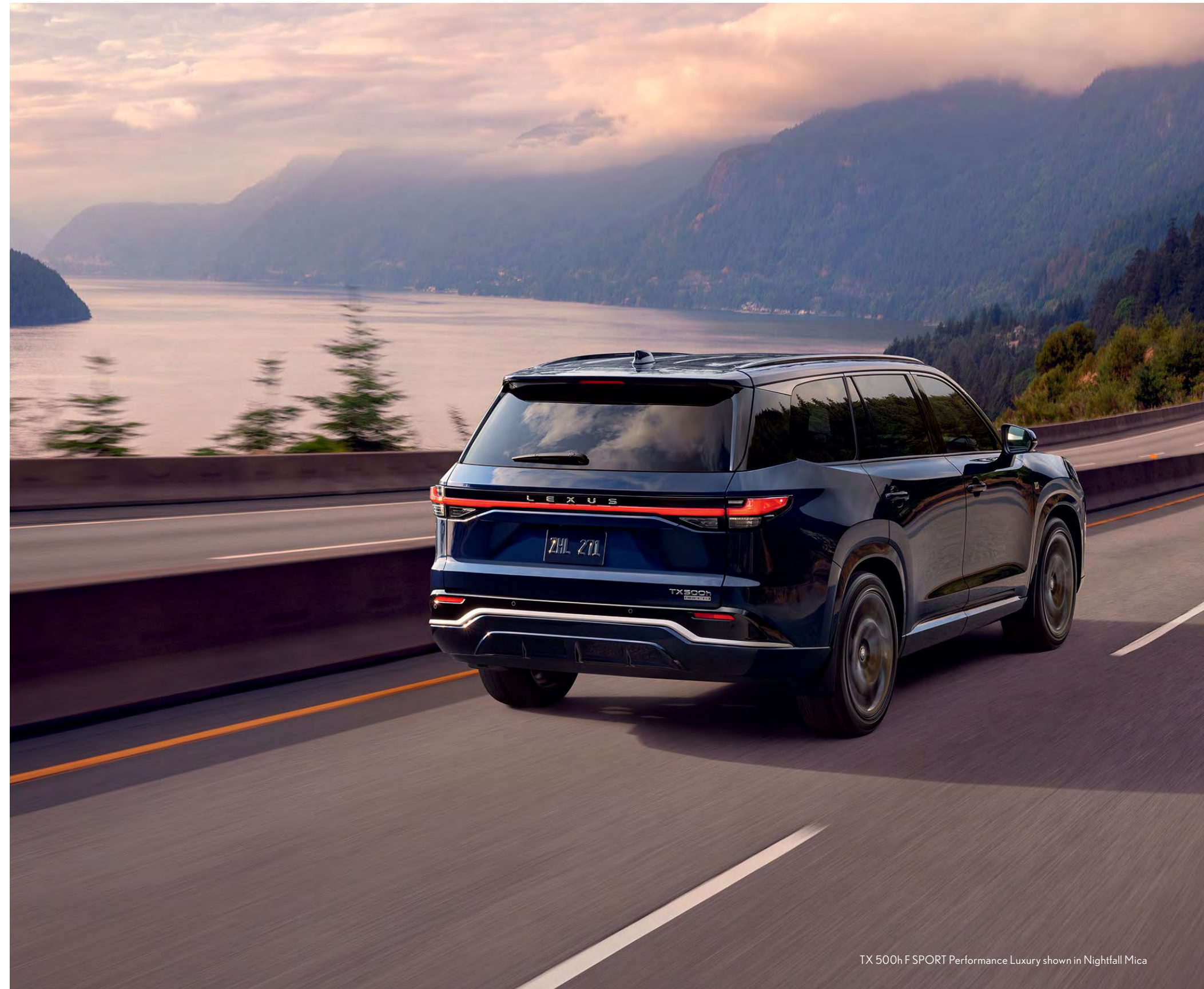
TX 500h F SPORT Performance Luxury shown in Nightfall Mica