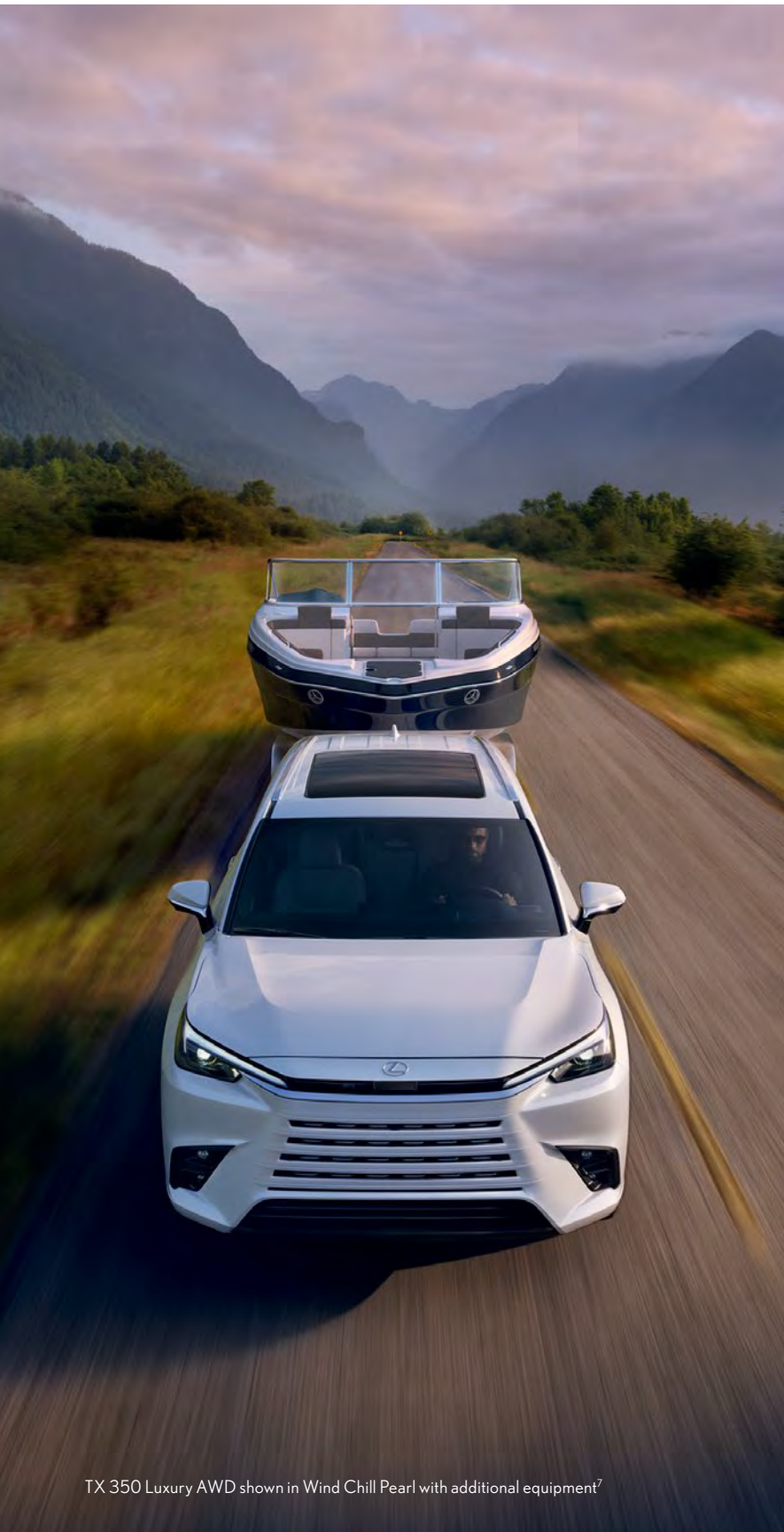
TX 350 Luxury AWD shown in Wind Chill Pearl with additional equipment 7