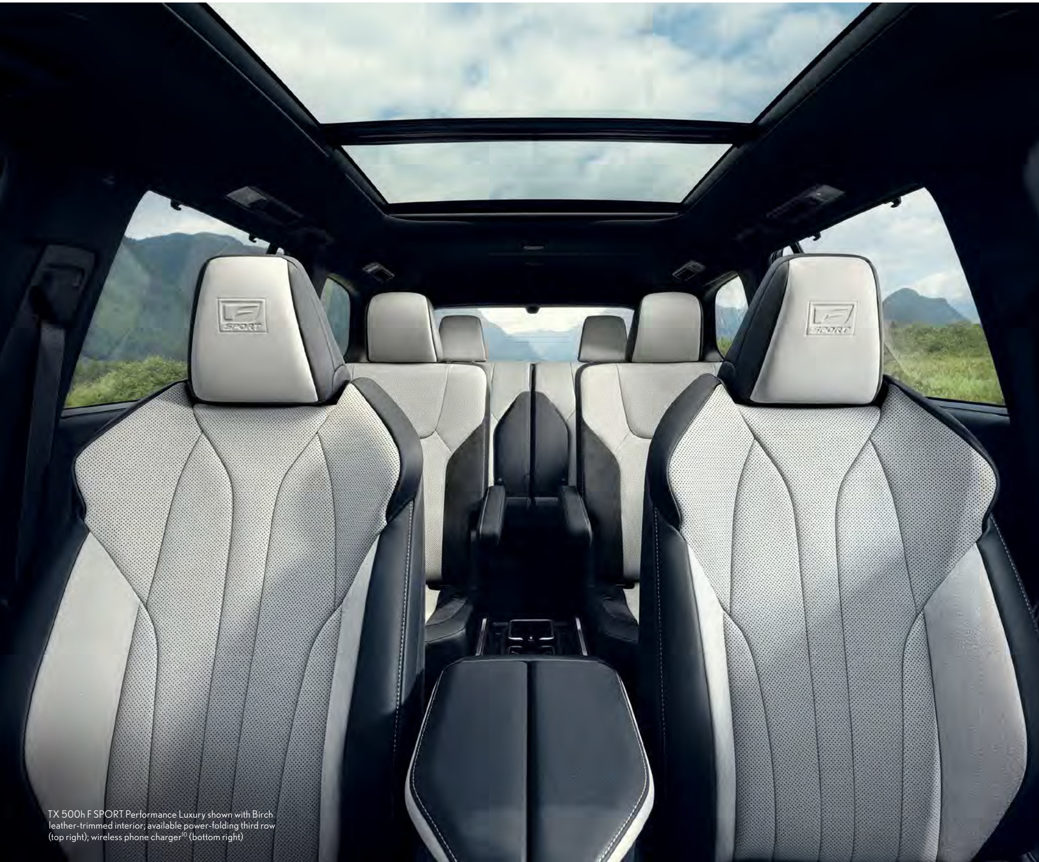
TX 500h F SPORT Performance Luxury shown with Birch leather-trimmed interior; available power-folding third row (top right); wireless phone charger 10 (bottom right)