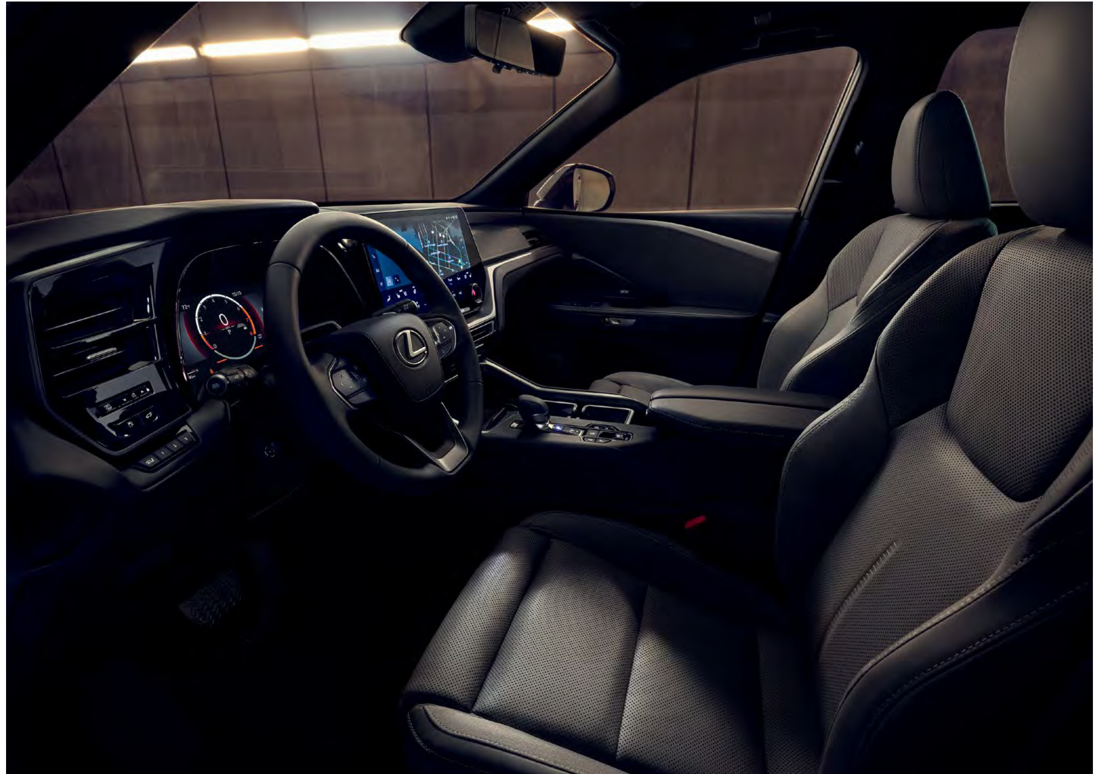
TX 350 Luxury AWD shown with Black semi-aniline leather and Black Grained interior trim

Crafted with a meticulous obsession to detail, the cockpit of the TX is a reminder that the inspiration behind every Lexus starts with the driver. With sculpted power-adjustable heated front seats with available ventilation, three-zone climate control and available selectable ambient lighting, the TX feels as if it was tailored just for you. An easy-access center console and standard wireless charging 10 offer added convenience. Rich materials including Black Grained trim and available semi-aniline leather-trimmed seating bring added elegance to every road trip. And as the cabin was designed to reduce unwanted noise, the TX is more than just a three-row SUV—it's your three-row sanctuary.