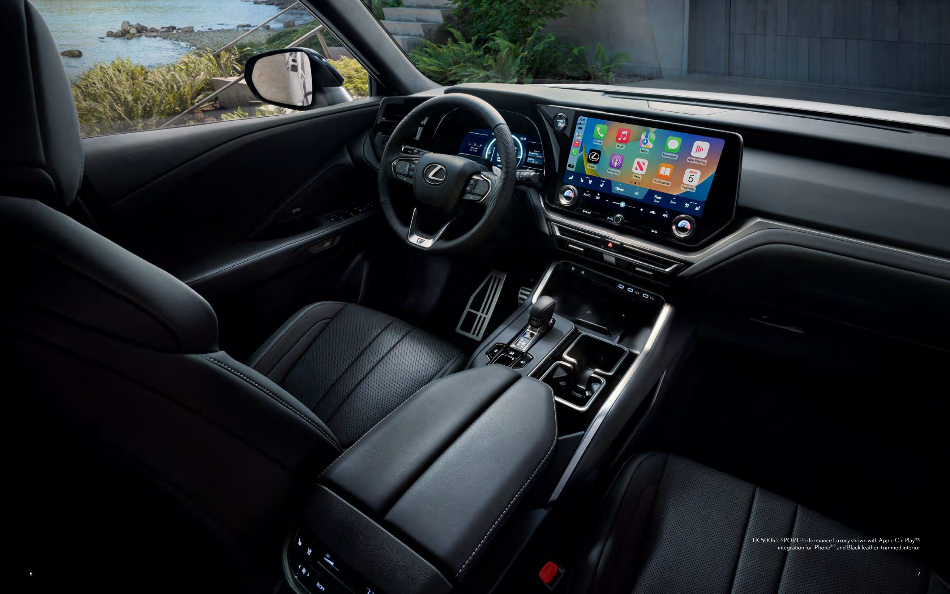
TX 500h F SPORT Performance Luxury shown with Apple CarPlay ® integration for iPhone ® and Black leather-trimmed interior