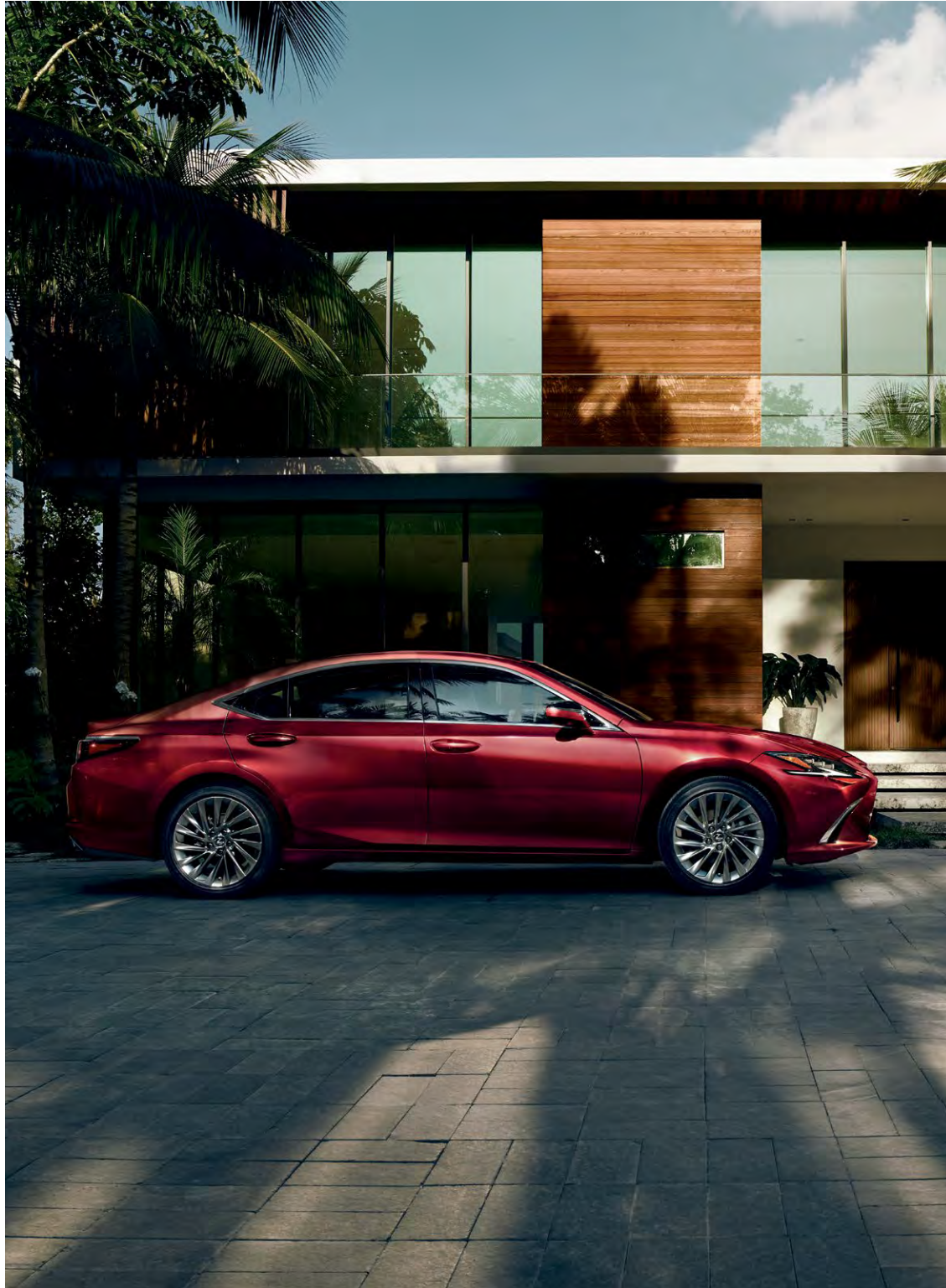
ES shown in Matador Red Mica