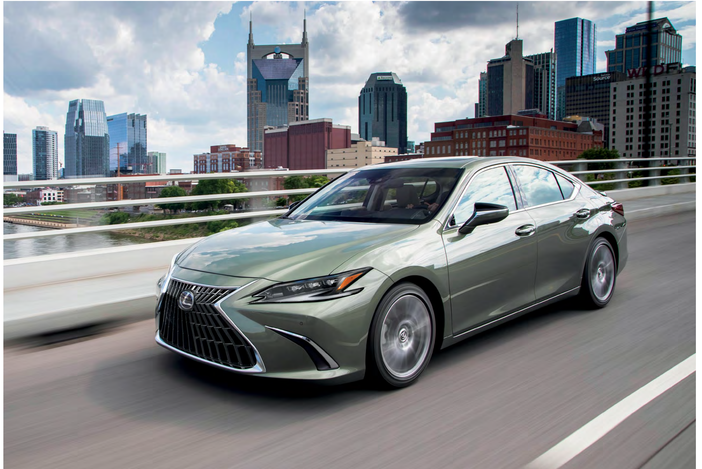
ESh shown in Sunlit Green

Combining next-generation hybrid technology and a highly potent 2.5-liter engine, this is the best of everything the ES has to offer. Its battery is not only remarkably small and lightweight, but also strategically placed as close to the middle of the vehicle as possible for optimized front/rear weight distribution and a lower center of gravity. And with paddle shifters that deliver driving dynamics similar to the ES 250 AWD and ES 350, the ES Hybrid and ES Hybrid F SPORT models bring you closer to the road than ever before. Pairing powerful performance with a 44-MPG combined estimate, 2 it isn't just the most fuel-efficient Lexus sedan ever—it's the most fuel-efficient among all non-plug-in luxury vehicles, 1 period.