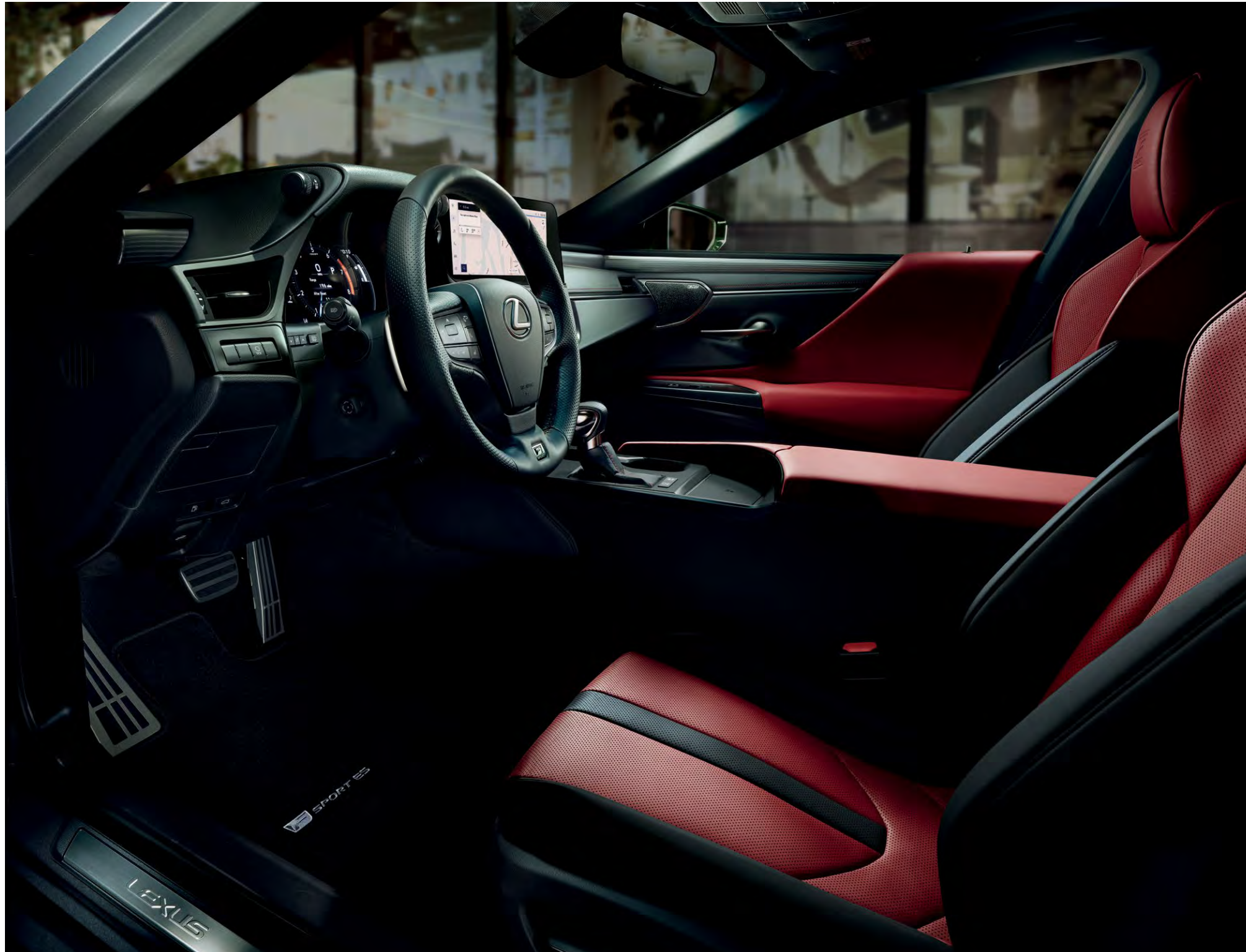
ES F SPORT Handling shown with Circuit Red NuLuxe® and Hadori Aluminum interior trim