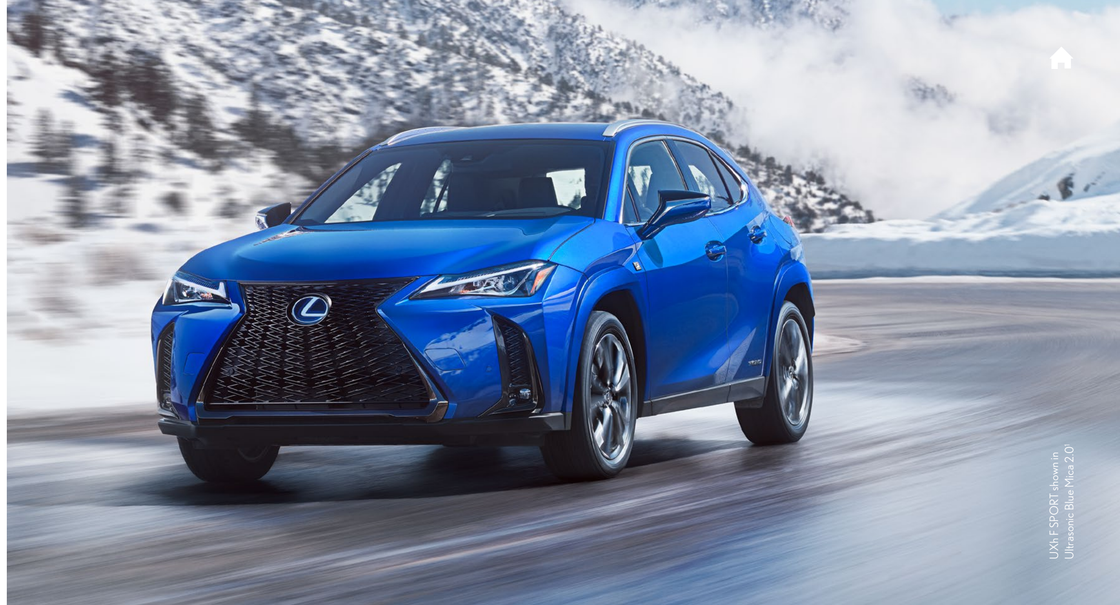
UX F SPORT shown in Ultrasonic Blue Mica 2.0 1