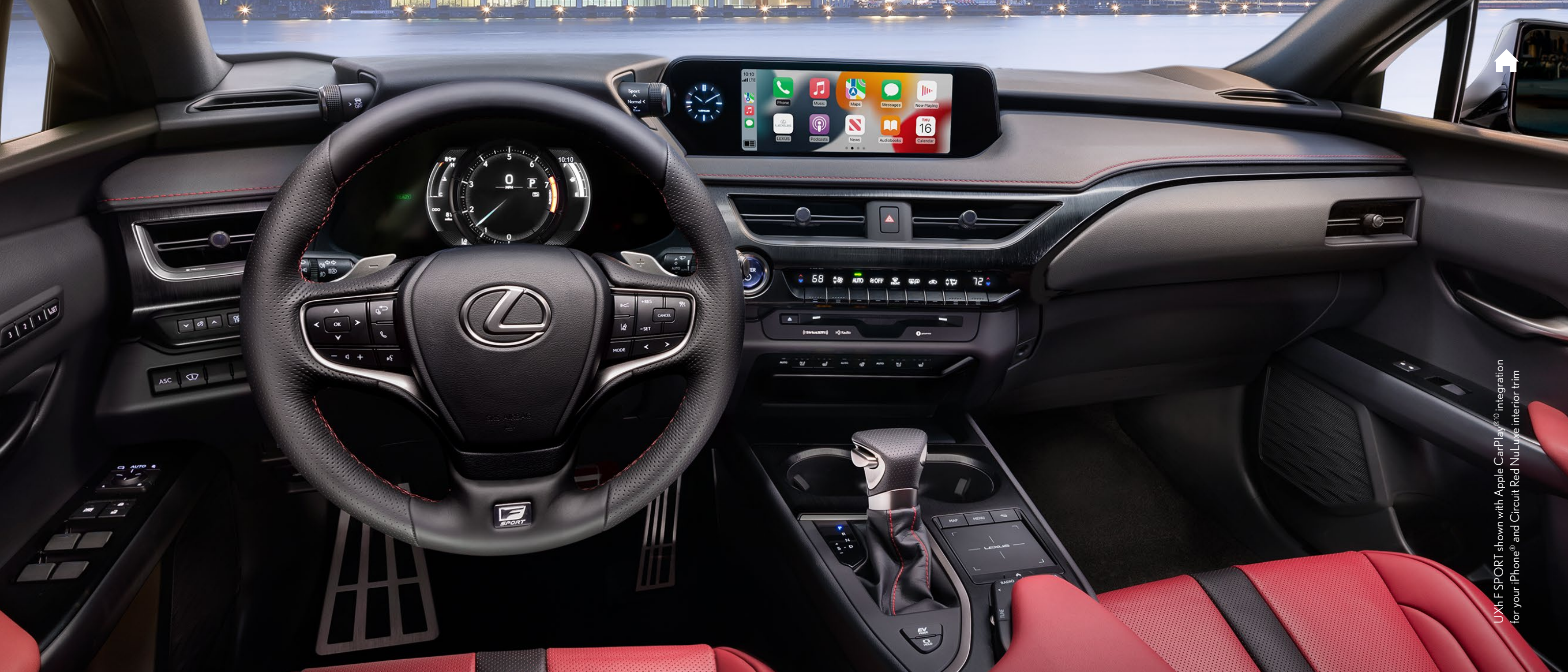
UXh F SPORT shown with Apple CarPlay SM integration for your iPhone ® and Circuit Red NuLuxe interior trim

DO MORE WITH YOUR SMARTPHONE. WHILE DOING MORE, PERIOD.