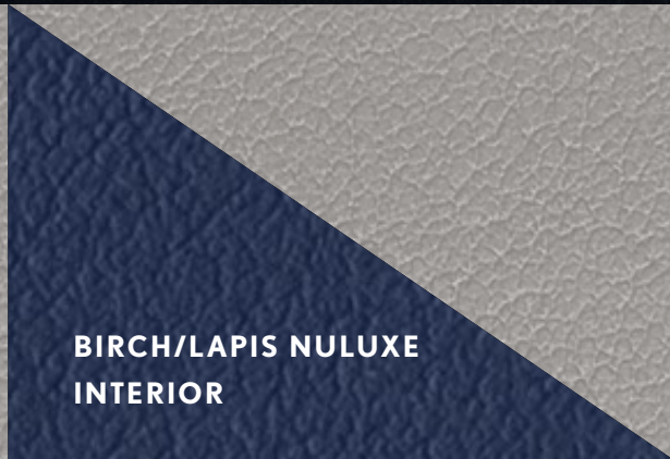
BIRCH/LAPIS NULUXE INTERIOR