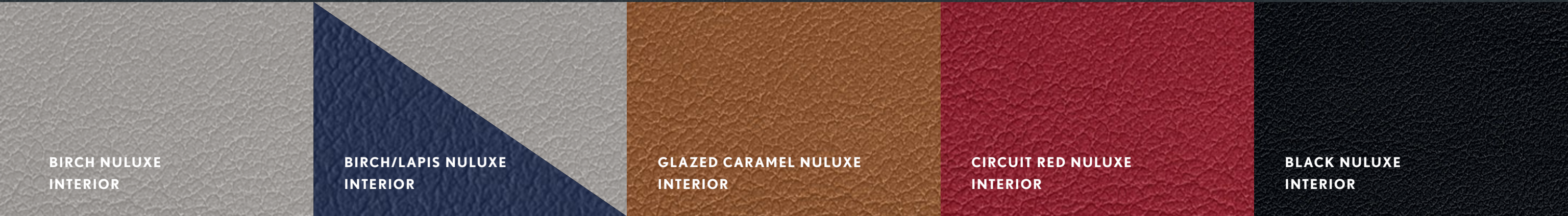
BIRCH NULUXE INTERIOR