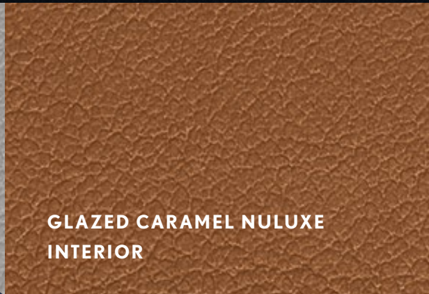
GLAZED CARAMEL NULUXE INTERIOR