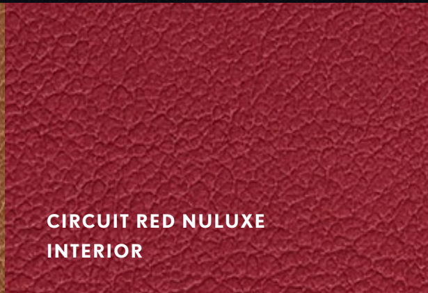
CIRCUIT RED NULUXE INTERIOR