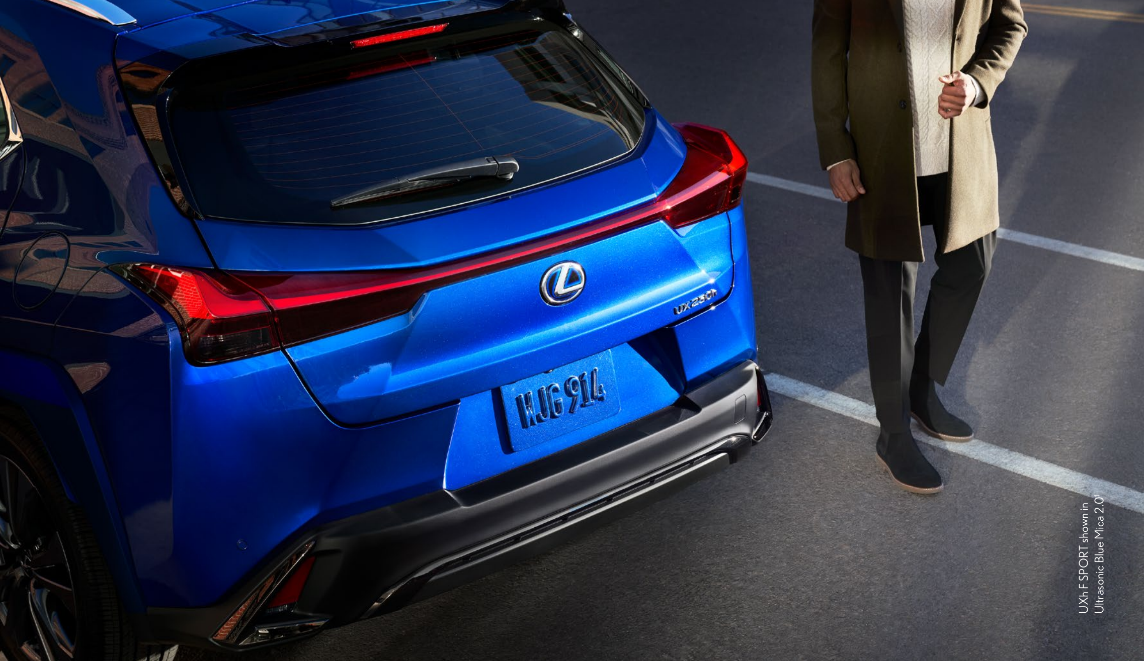
UXh F SPORT shown in Ultrasonic Blue Mica 2.0*