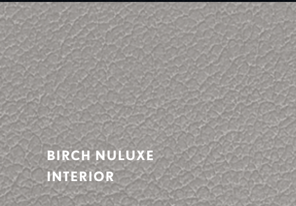
BIRCH NULUXE INTERIOR