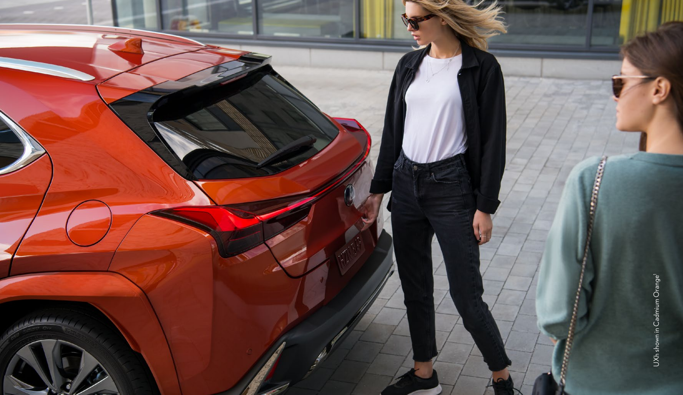
UXh shown in Cadmium Orange 1