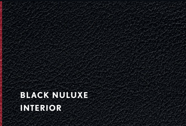
BLACK NULUXE INTERIOR