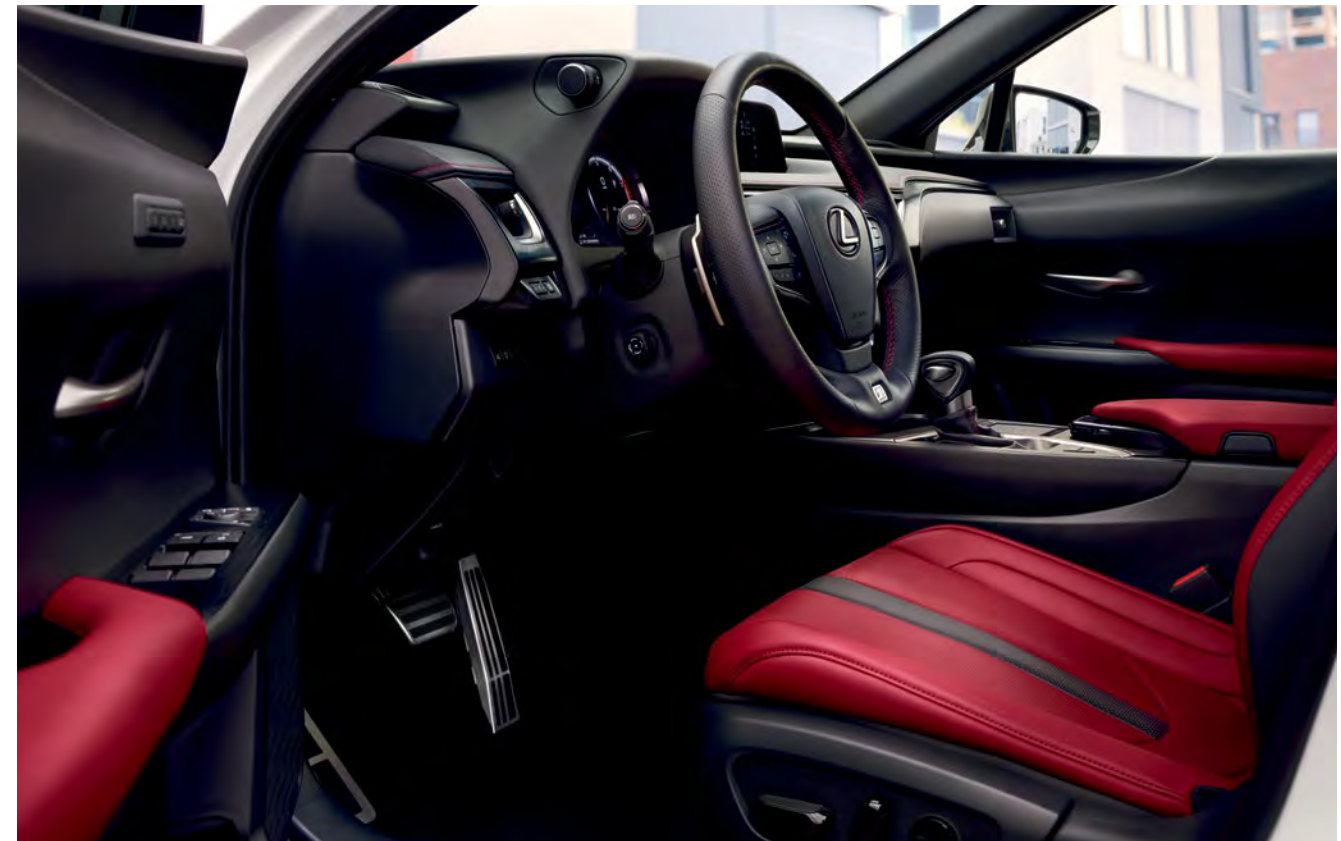
UX F SPORT shown with Circuit Red NuLuxe 14 interior trim