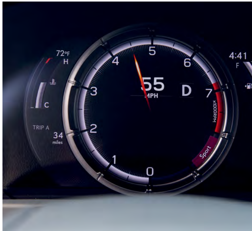
UXh F SPORT shown in Ultra White 1

Both UX F SPORT models offer the next level of dynamic handling, rigidity and responsiveness. From lightning-fast paddle shifters to an exclusive sport-tuned suspension, they deliver performance as aggressive as their design. For an even more visceral driving experience, they also emit a throaty engine note at higher rpm. Meanwhile, performance-inspired digital gauges move in concert with a sliding bezel, expanding and retracting digital readouts when information is accessed.