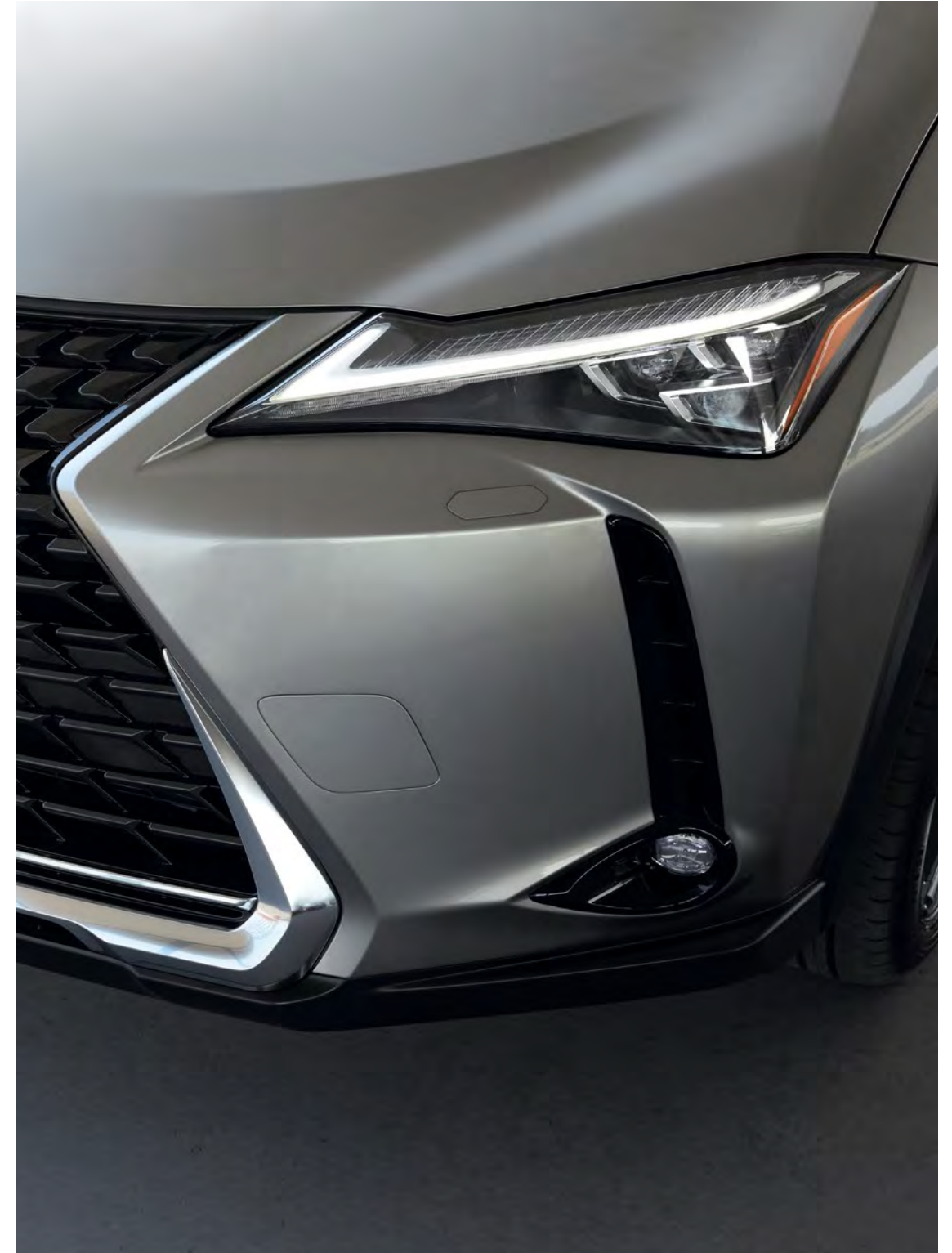
UX shown in Atomic Silver

Delivering a refreshing take on crossover styling, the UX offers striking triple-beam LED headlamps and integrated daytime running lights, and features aerodynamic taillamps that blend 120 LEDs into one continuous line that tapers to a mere three millimeters in the center. And merging traditional Japanese aesthetics with contemporary luxury, available washi trim is uniquely crafted to mimic the soft grain of Japanese paper, adding distinctive texture and style to the dash. For added convenience, the UX 250h features a configurable cargo area 15 to accommodate taller items.