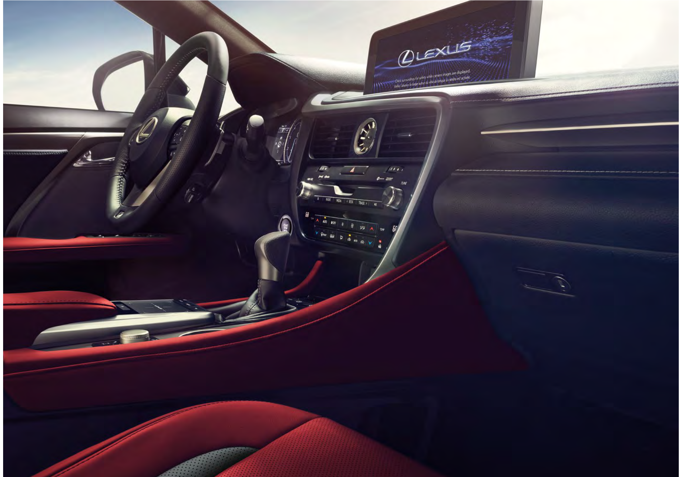
RX F SPORT shown with Circuit Red NuLuxe ®10 and Scored Aluminum interior trim

Customize the climate around you. Individual settings allow the driver and front passenger to adjust their preferred temperatures. Plus, the RX 350L and RX 450hL feature dedicated climate control for passengers in the third row. To help ensure the cabin stays fresh, an available smog-sensing climate-control system automatically switches into recirculation mode if it senses high levels of pollutants outside.