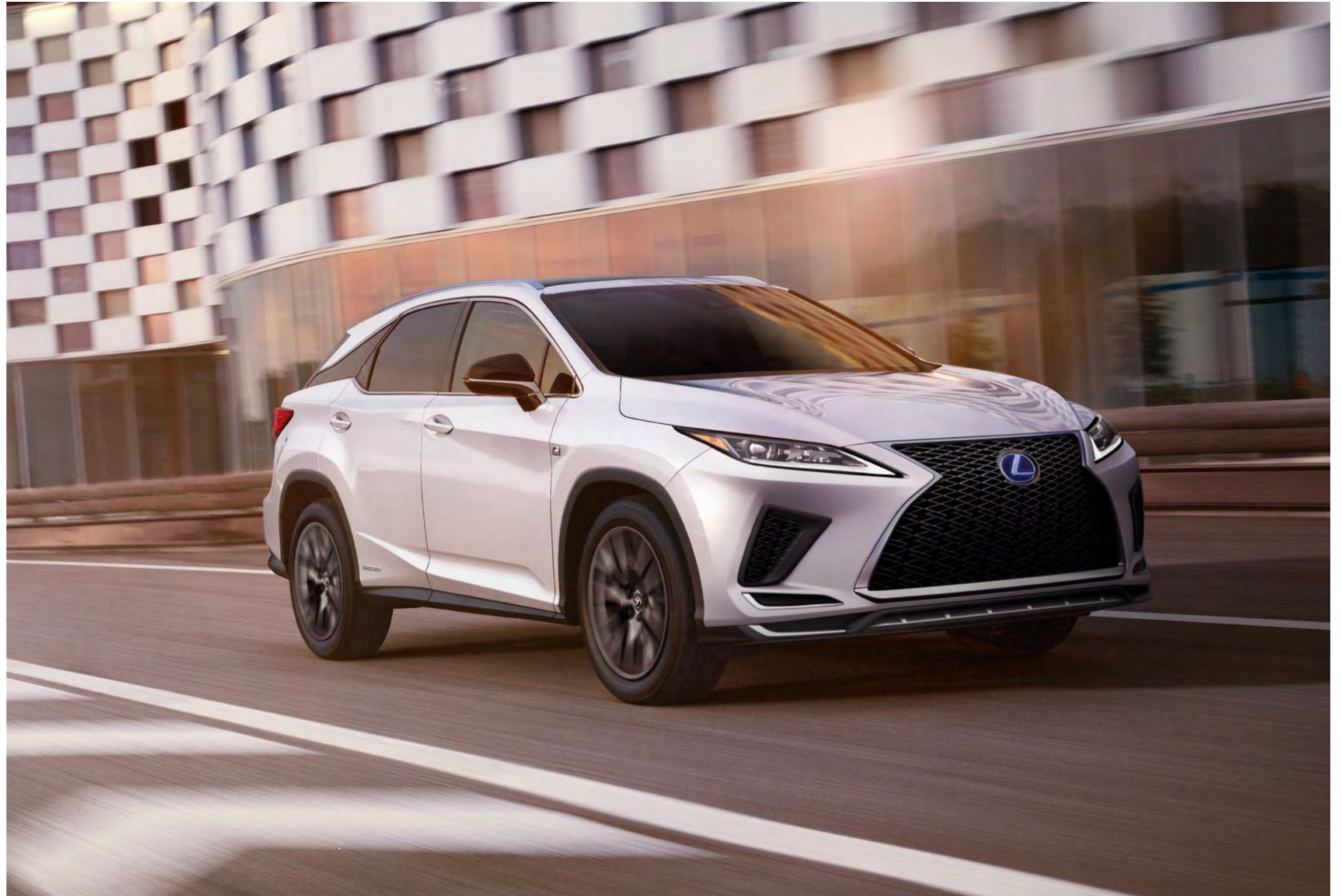
RXh F SPORT shown in Ultra White 9

Craving more of an edge? The RX 450h F SPORT adds bold styling and offers an Adaptive Variable Suspension that takes exhilaration even further.