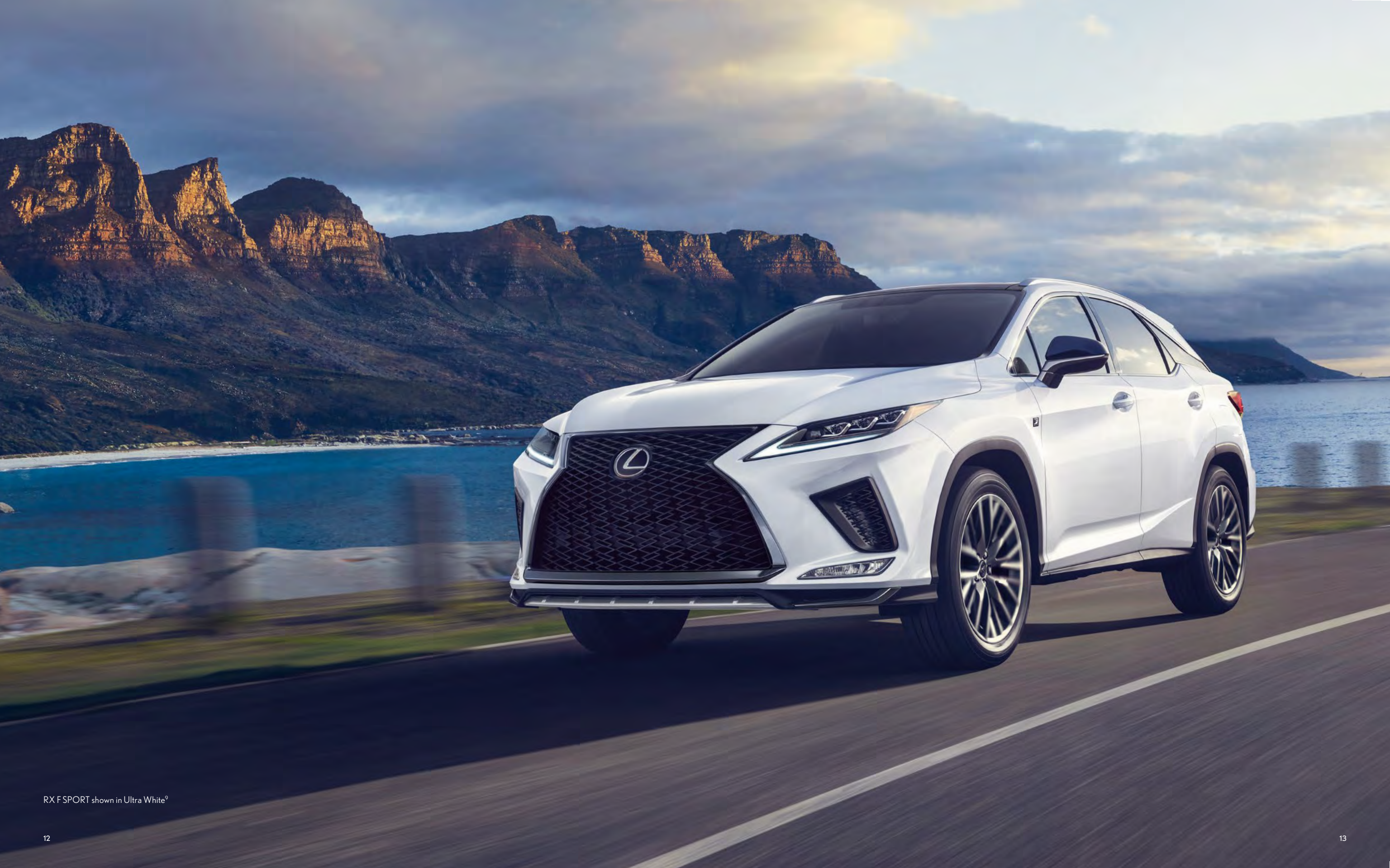
RX F SPORT shown in Ultra White 9