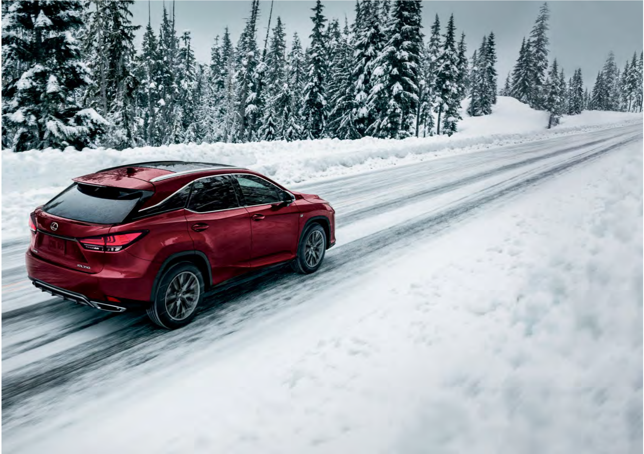
RX F SPORT AWD shown in Matador Red Mica