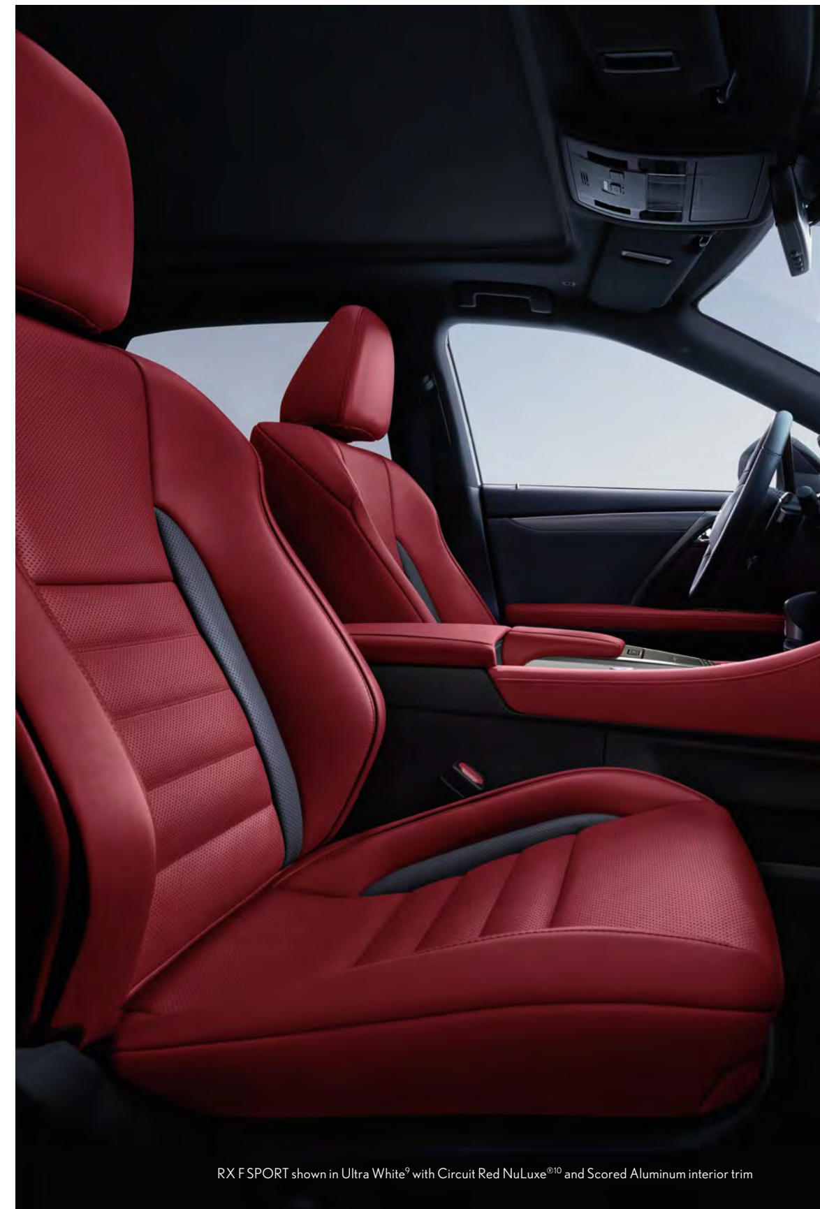
RX F SPORT shown in Ultra White 9 with Circuit Red NuLuxe ®10 and Scored Aluminum interior trim