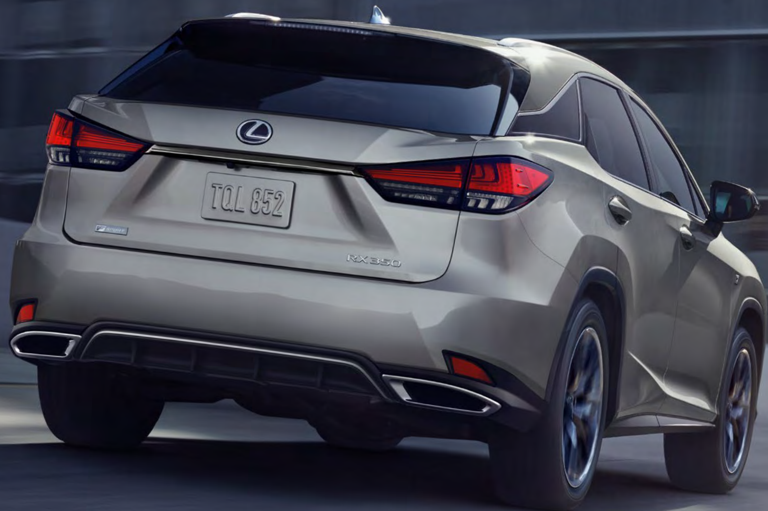
RX F SPORT shown in Atomic Silver