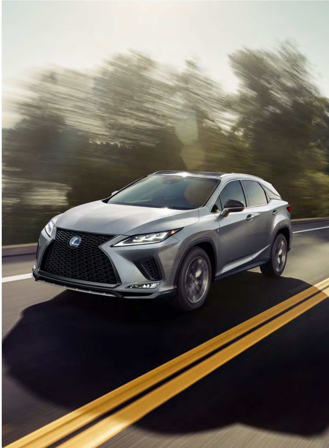
RX F SPORT shown in Atomic Silver