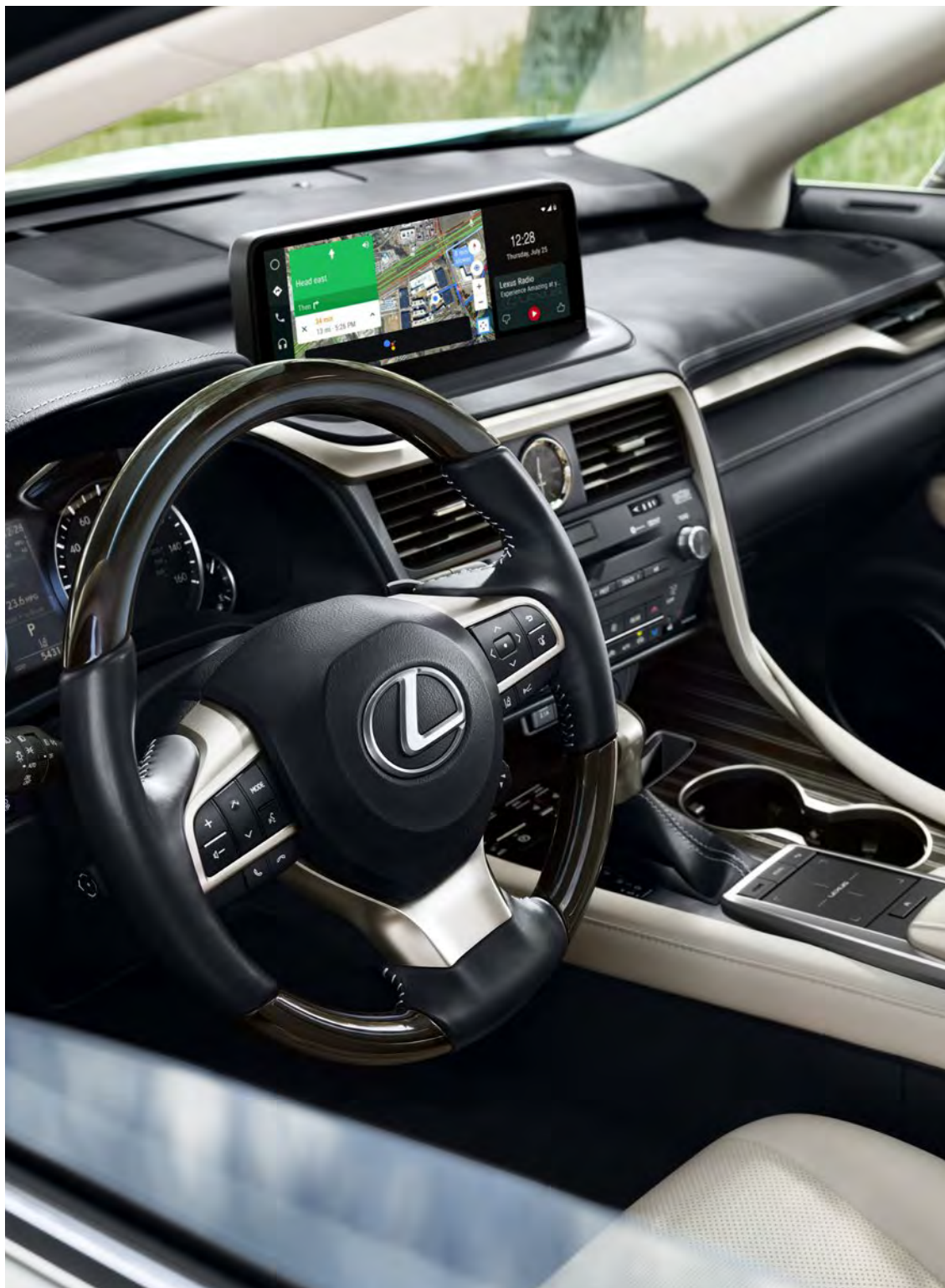
RXL shown with Parchment semi-aniline leather and Gray Sapele wood with Aluminum interior trim