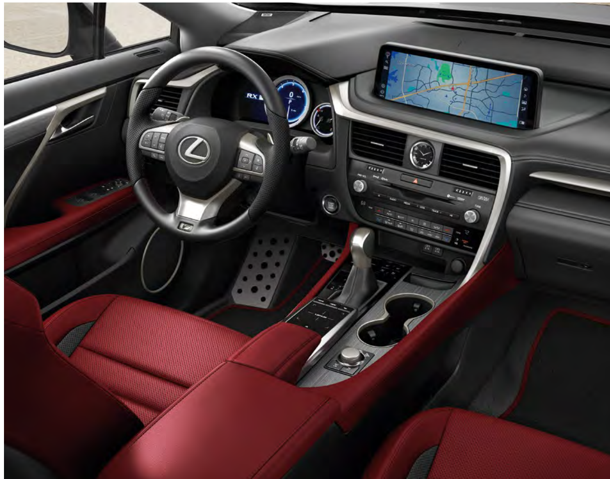
RX F SPORT shown with Circuit Red NuLuxe ®10 and Scored Aluminum interior trim

The bold F SPORT perspective is obvious throughout the driver-centric interior. In addition to exclusive race-inspired instrumentation and bold aluminum accents, you'll find performance upgrades, including bolstered sport seats, a black headliner, a perforated leather-trimmed sport steering wheel and shift knob, plus aluminum pedals and more.