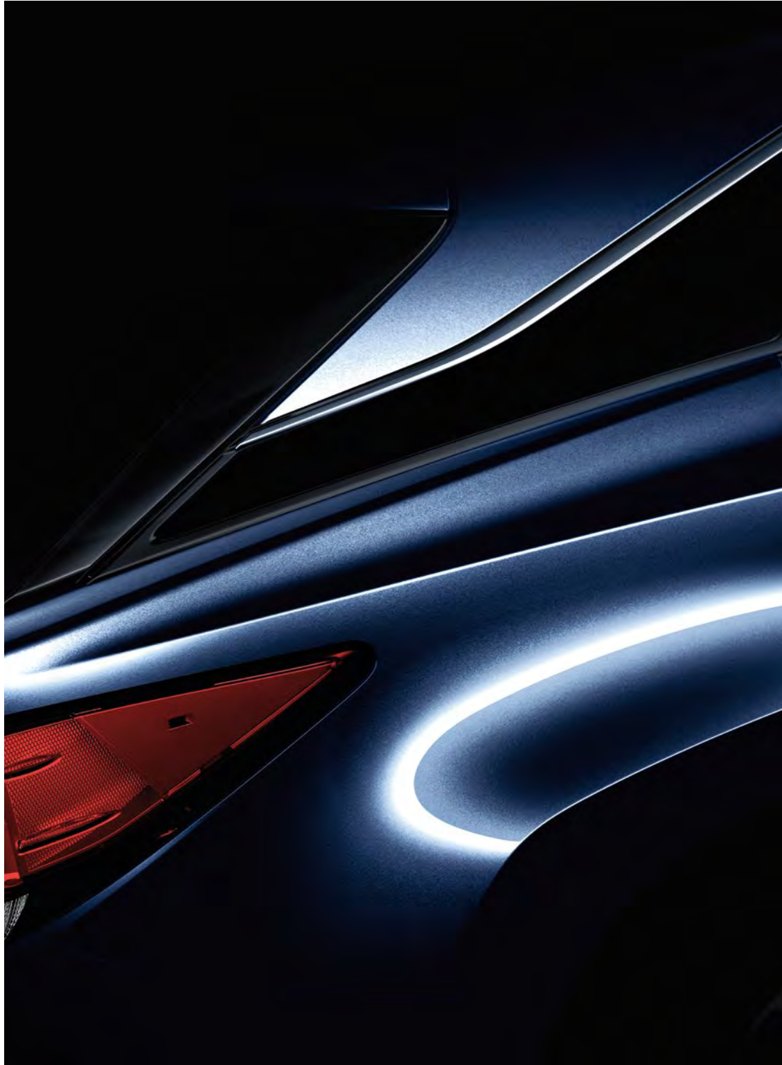
RX shown in Nightfall Mica