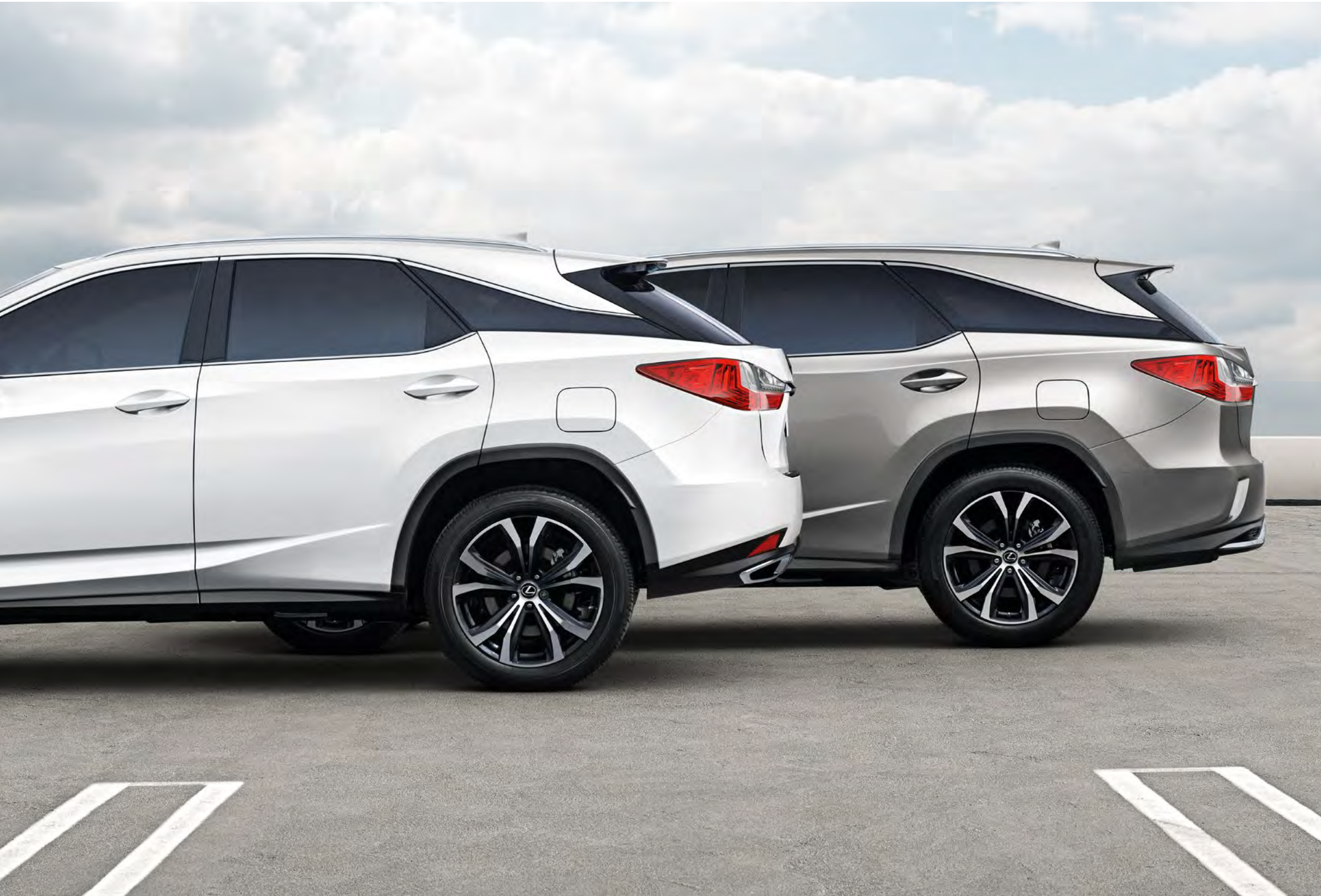
RX shown in Eminent White Pearl 9 (left), RXL shown in Atomic Silver (right)