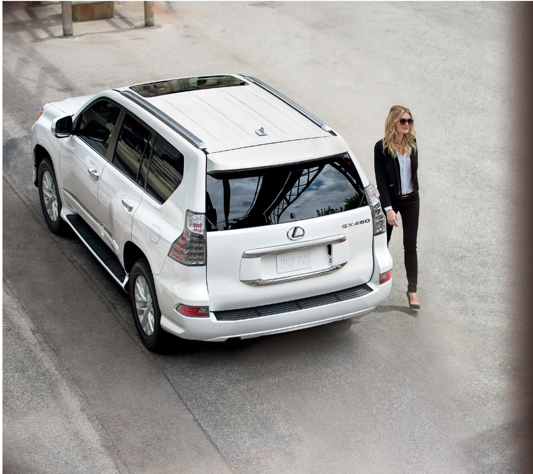
GX shown in Starfire Pearl // Options shown