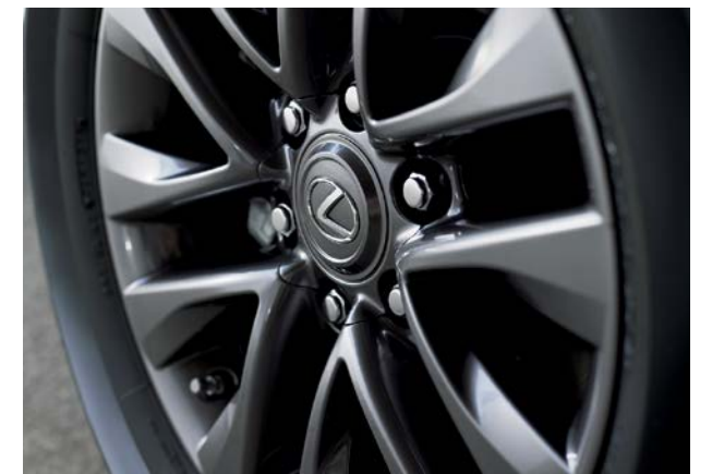
GX shown in Silver Lining Metallic // Options shown

— Designed to the highest and most exact standards. Ours.