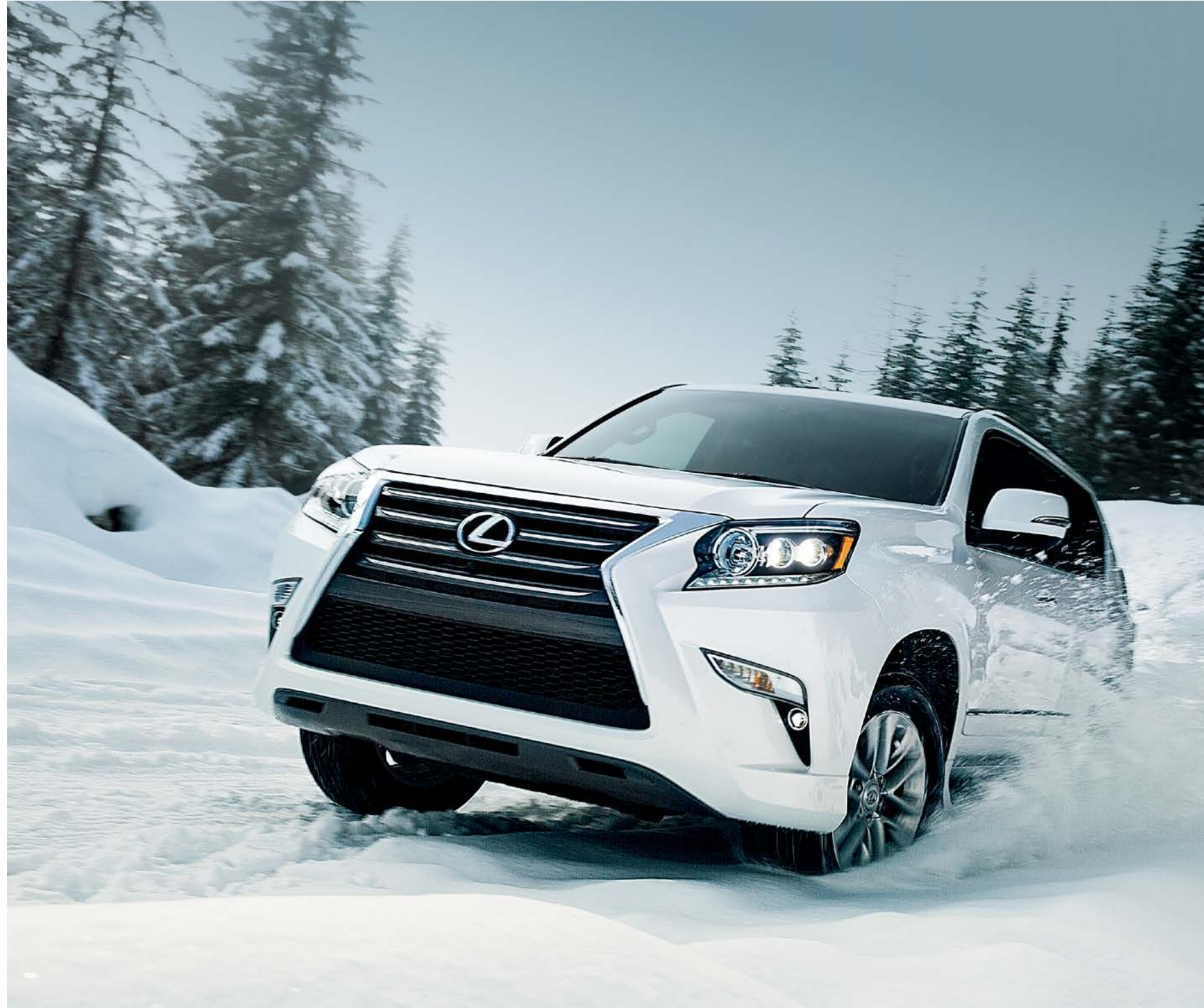
GX shown in Starfire Pearl // Options shown