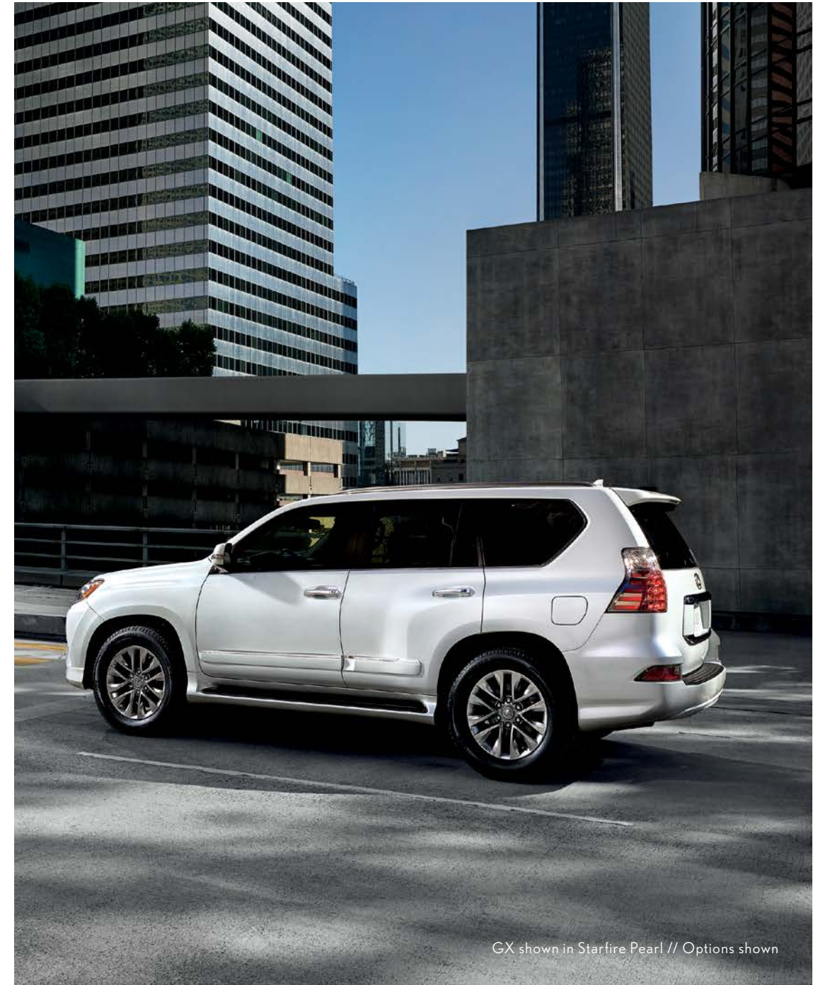
GX shown in Starfire Pearl // Options shown