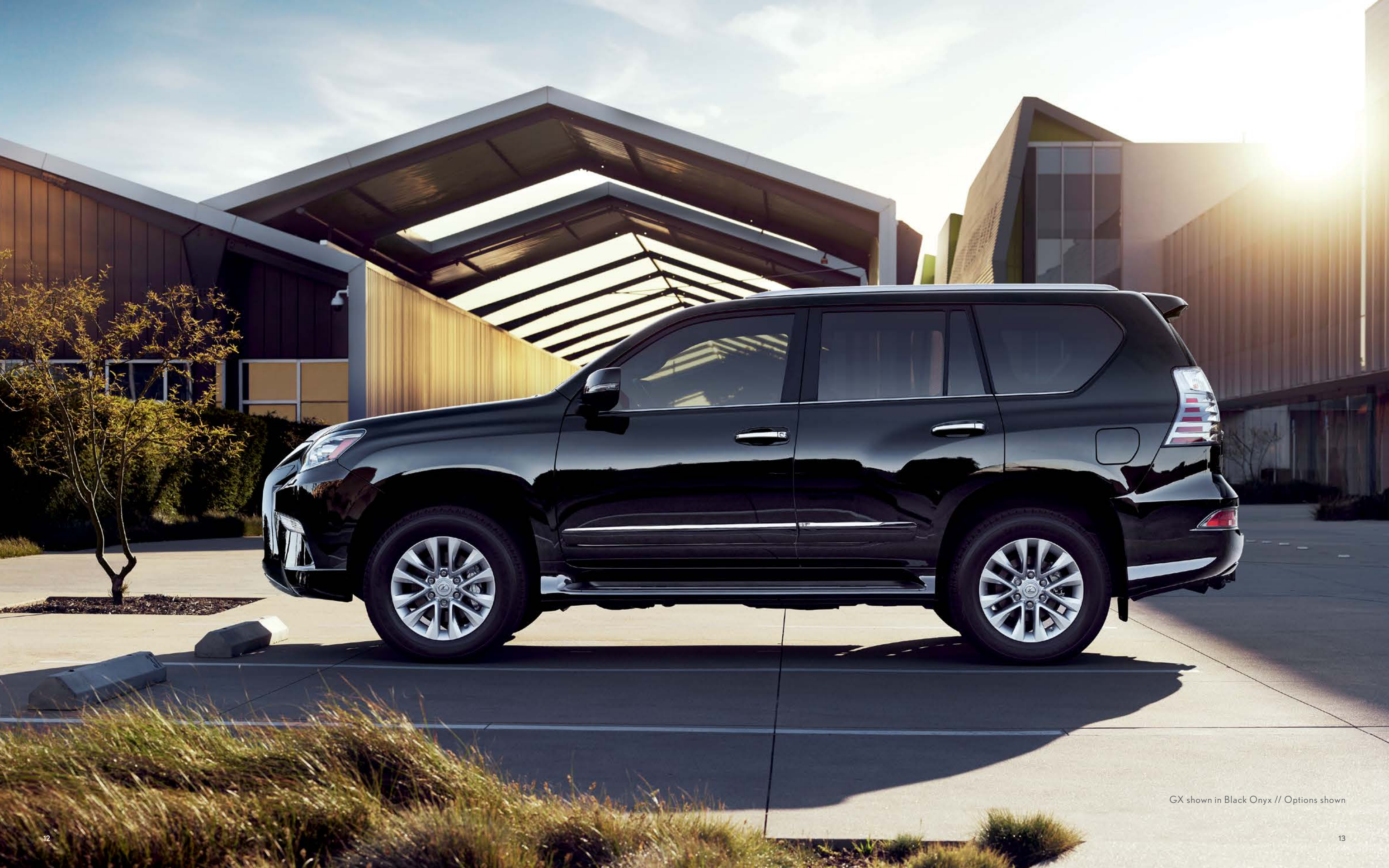
GX shown in Black Onyx // Options shown