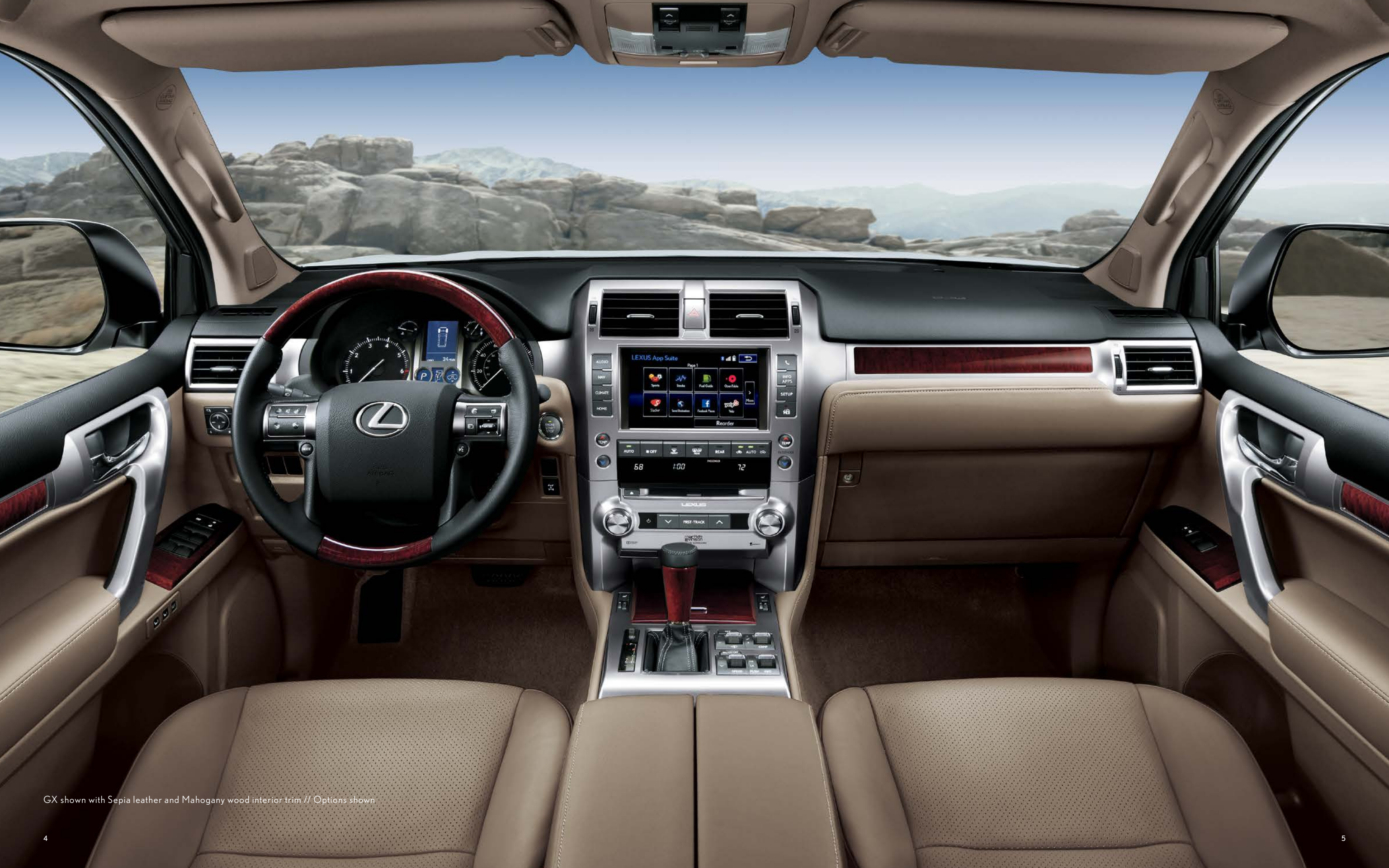
GX shown with Sepia leather and Mahogany wood interior trim // Options shown