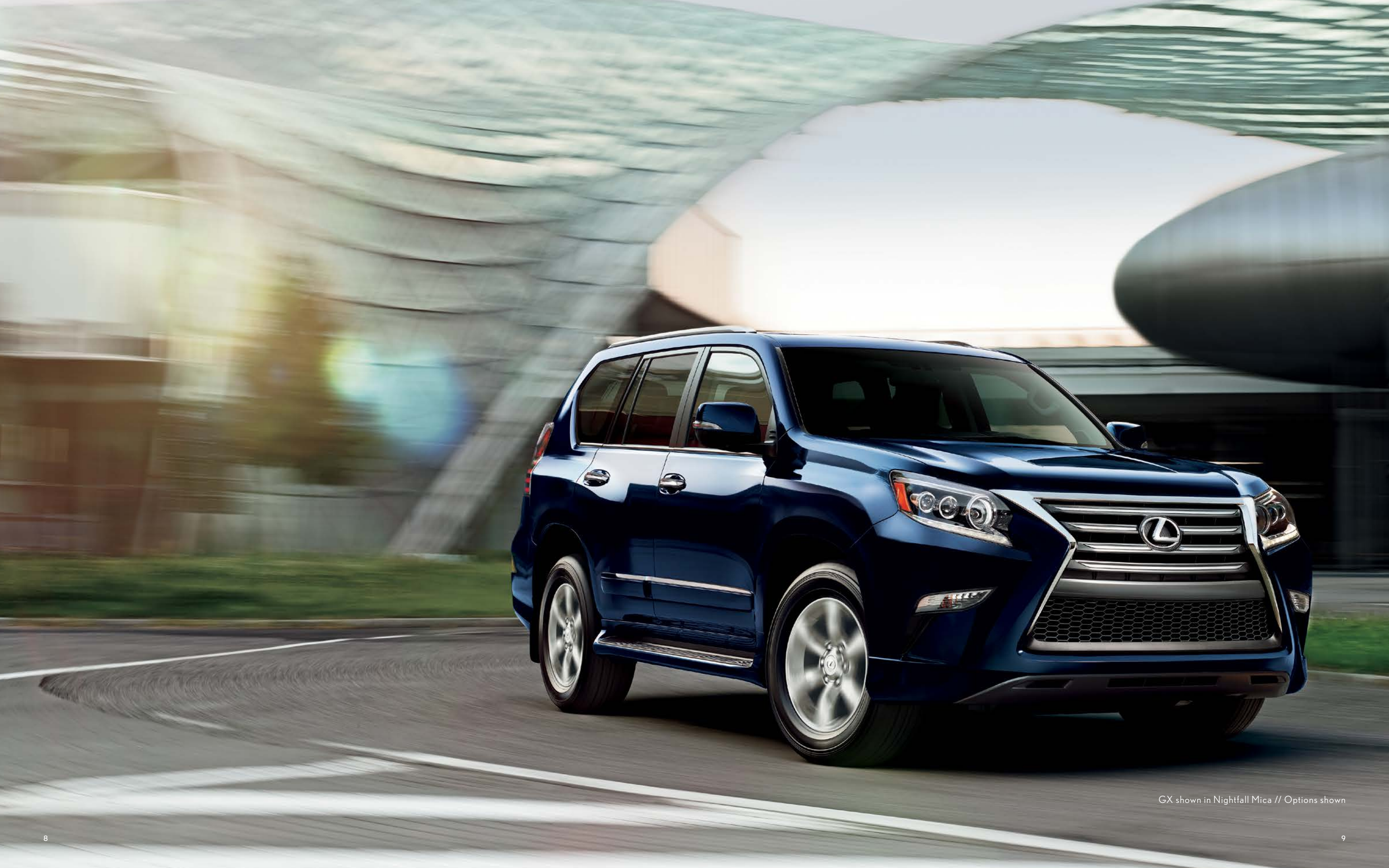
GX shown in Nightfall Mica // Options shown