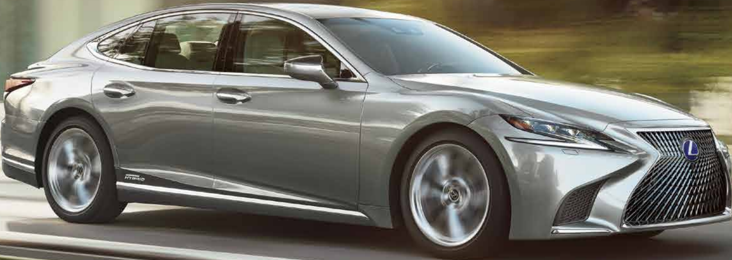
LSh shown in Atomic Silver // Options shown

Thanks to Multistage Hybrid Drive technology, the LS 500h delivers the visceral feel of a high-performance coupe. It is built on an advanced powertrain: a 354-hp, 24-valve Atkinson-cycle gas engine, powerful yet compact dual electric motors, and our lightest, most compact lithium-ion battery. These groundbreaking innovations come together to create the direct, instinctive feel of a 10-speed transmission and a new experience of hybrid performance.