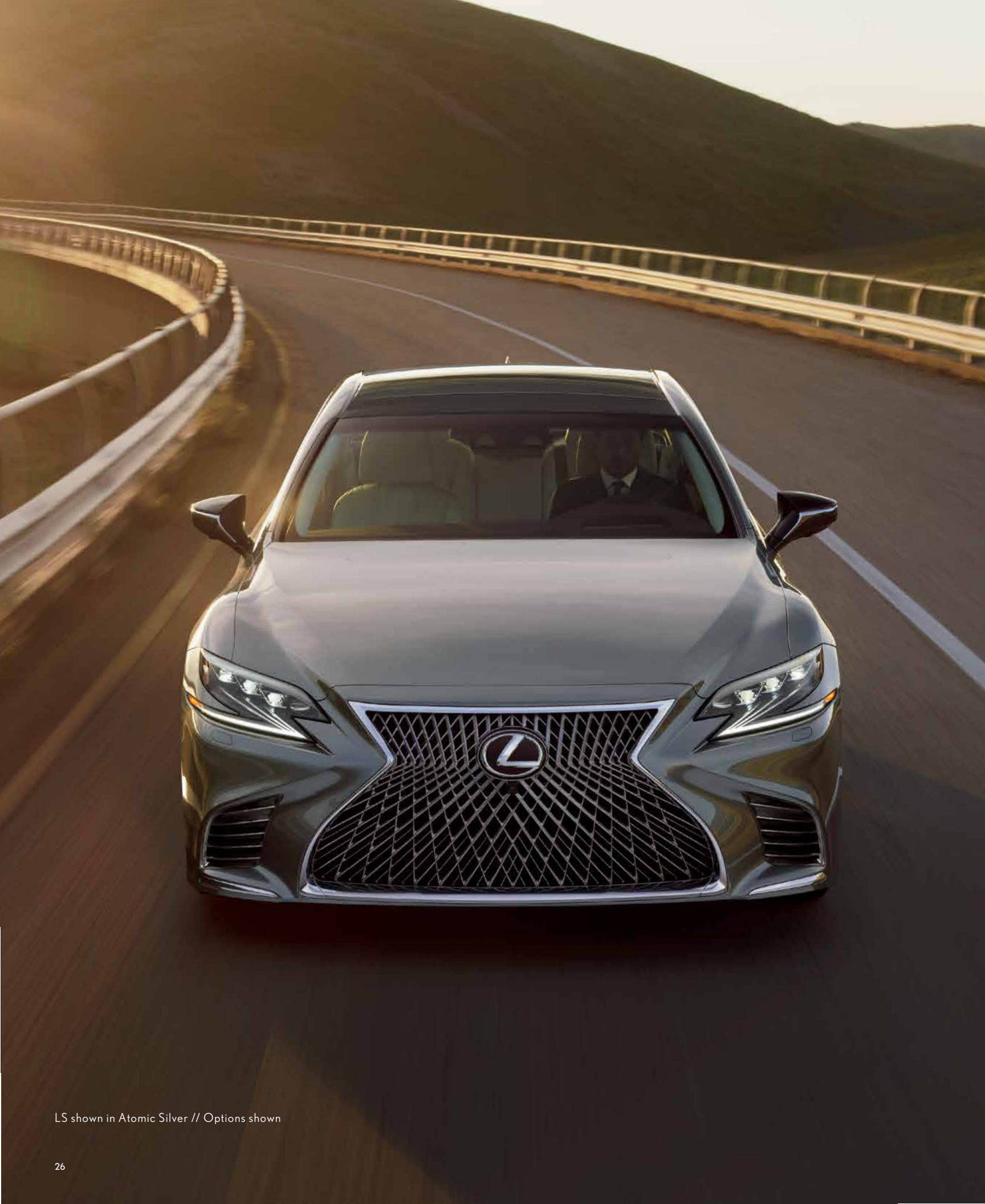
LS shown in Atomic Silver // Options shown