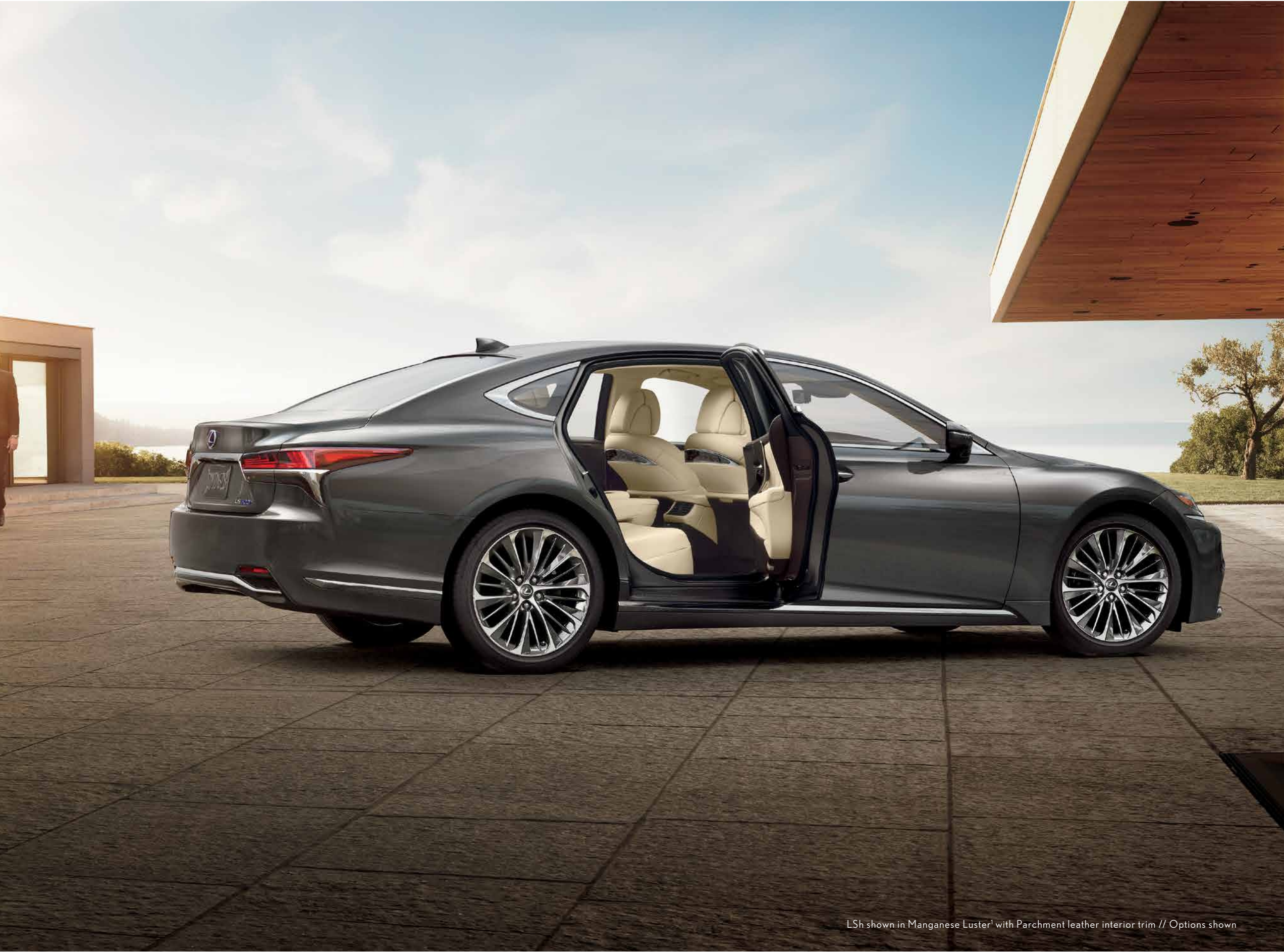
LS shown in Manganese Luster 1 with Parchment leather interior trim // Options shown

From the inventors of the prestige hybrid sedan—now with seven generations of industry-leading technological refinement—comes a new benchmark. The LS 500h is the first multistage hybrid prestige luxury sedan 3 and, with the instinctive feel of a 10-speed automatic transmission, the most responsive and fastest LS Hybrid yet. 9 Combining world-class craftsmanship, impressive fuel economy, 3 and the robust performance of dual power sources that are always charged and ready, the LS 500h is the breakthrough that recasts the entire concept of excellence in the category.