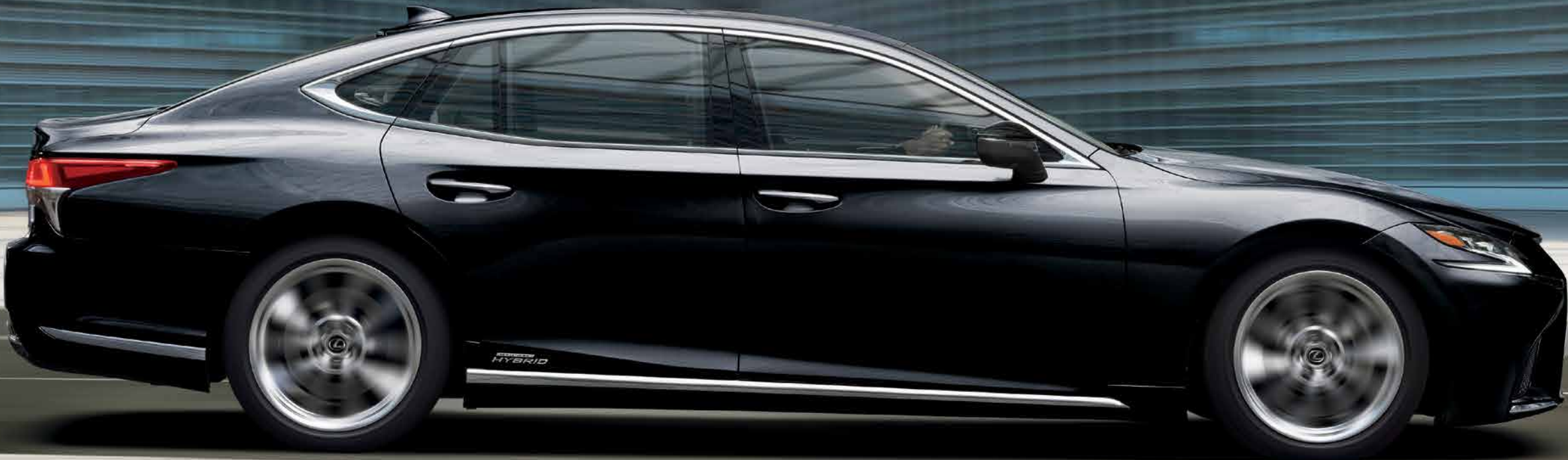
LS shown in Caviar

The 2018 LS is available in all-wheel drive and rear-wheel drive models and shares a front-engine platform with the high-performance LC coupe. The all-new front-midship design delivers exceptional balance and allows for a lower overall height and driver position, enhancing handling thanks to a lower center of gravity. The result is sport-inspired stability, responsiveness and, ultimately, one of the most confident and engaging driving experiences we've ever created.