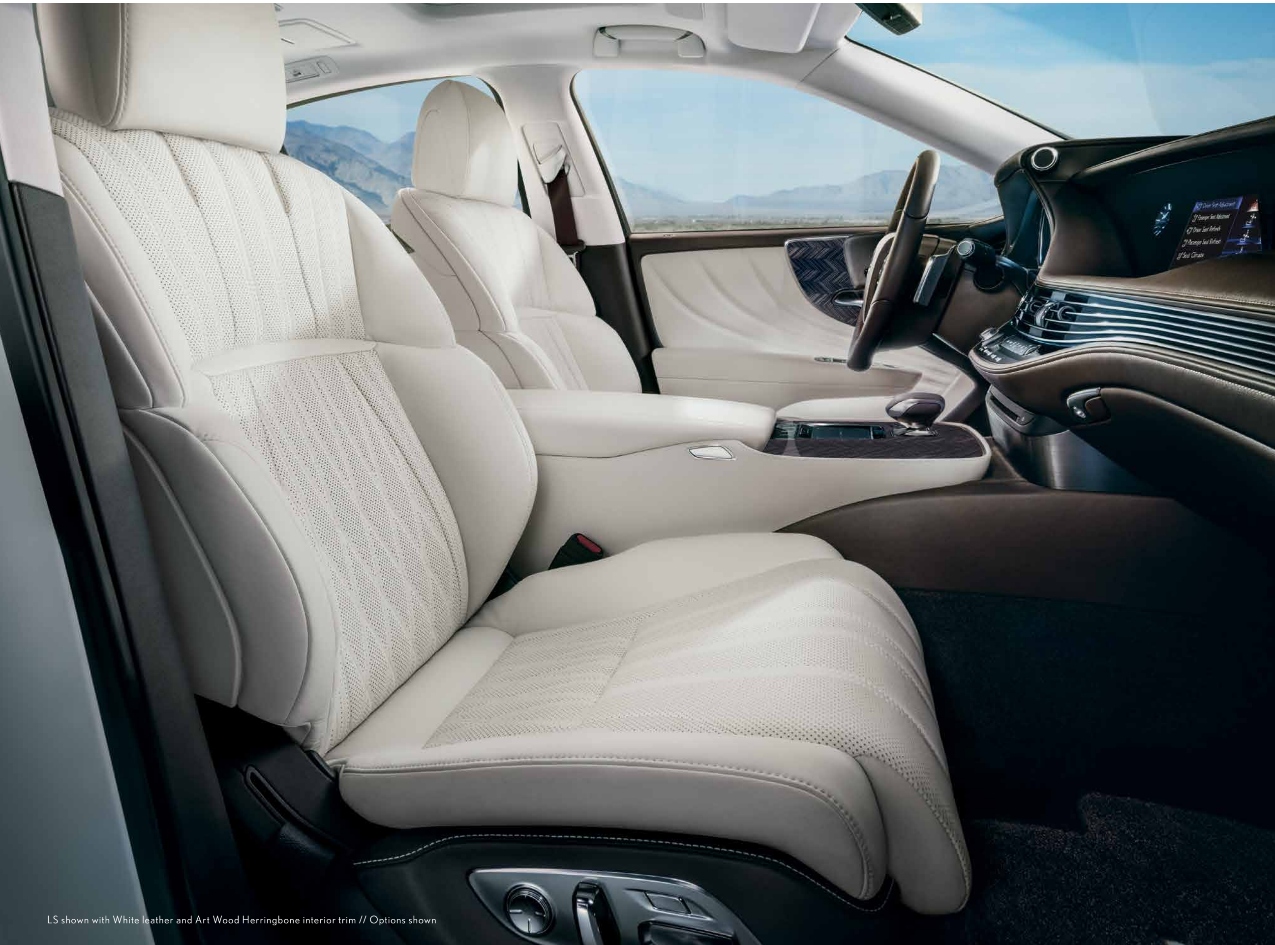
LS shown with White leather and Art Wood Herringbone interior trim // Options shown

When comfort and convenience are designed to be this intuitive—and created to anticipate every need—it's easy to take for granted all of the refined amenities in the LS that are truly unique. The available four-zone Climate Concierge automatically adjusts the temperature in each area of the entire cabin at the press of a button. The air ducts, the temperatures of the front and rear heated and ventilated seats, and the heated steering wheel all automatically adjust individually so that each zone reaches its preset level of comfort as quickly as possible, using a groundbreaking air distribution system that helps maintain freshness. The available 28-way adjustable front seats are our most customizable and comfortable yet. And the seat-cushion extender on the front-seat edge can extend and fully support your thighs—yet another way the LS goes to great lengths to reach your specific level of comfort.