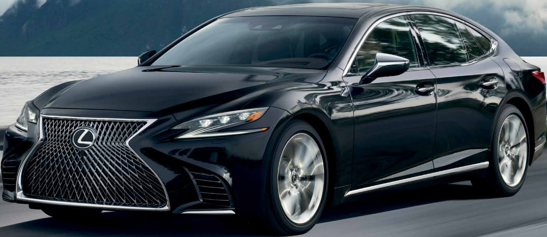
LS shown in Obsidian // Options shown

Numerous next-generation Lexus technologies work together for a unique approach to comfort and control. Adaptive Variable Suspension features dampers that are continuously variable through 650 levels, allowing you to stiffen or soften the drive for enhanced response or comfort, based on your preferred drive mode. The all-new front and rear suspension supports were created from cast aluminum, drastically improving handling stability and allowing the driver to receive direct feedback through the steering wheel. And available Active Rear Steering automatically computes the optimum steering angle for all wheels, enhancing overall vehicle agility and control.