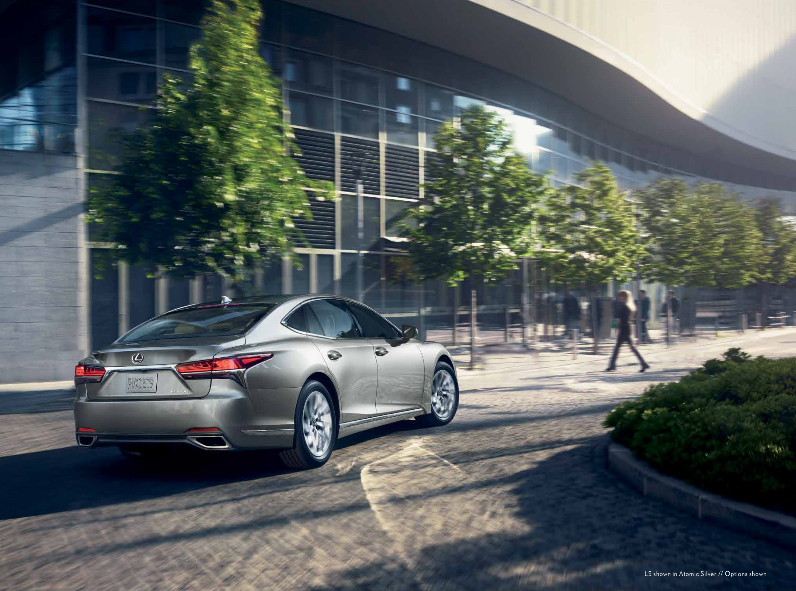
LS shown in Atomic Silver // Options shown

Available Lexus Safety System+ A is the most progressive suite of Lexus driver assistance systems yet. 16 It includes our most advanced lane assistance technologies, 16 as well as a way for the LS to scan the road ahead and alert you if a vehicle or pedestrian is on a trajectory to make an impact with the vehicle. 16 Also, the new LS can automatically help brake or steer away if it detects an impending collision, while still remaining in its lane. 16 And the all-new Road Sign Assist 22 uses a built-in camera to help make sure you have the most accurate road information. It's our vision of an accident-free world, one step closer to being realized.