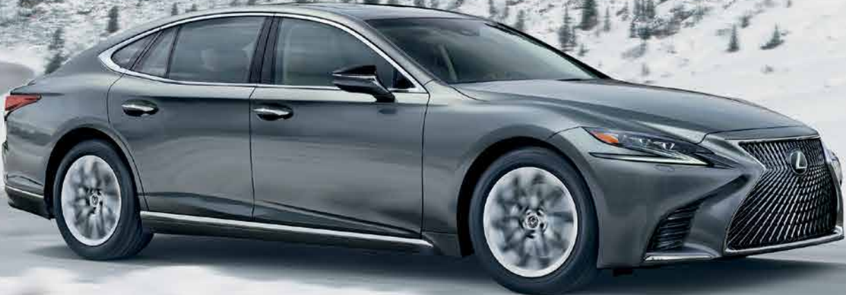
LS AWD shown in Manganese Luster 1 // Options shown

Never sacrifice style for capability with all-wheel drive, available on every LS model. Full-time all-wheel drive delivers engine power to all four wheels, and a TORSEN® limited-slip center differential 12 efficiently distributes it between the front and rear axles, helping optimize traction, handling and control in a variety of driving conditions.