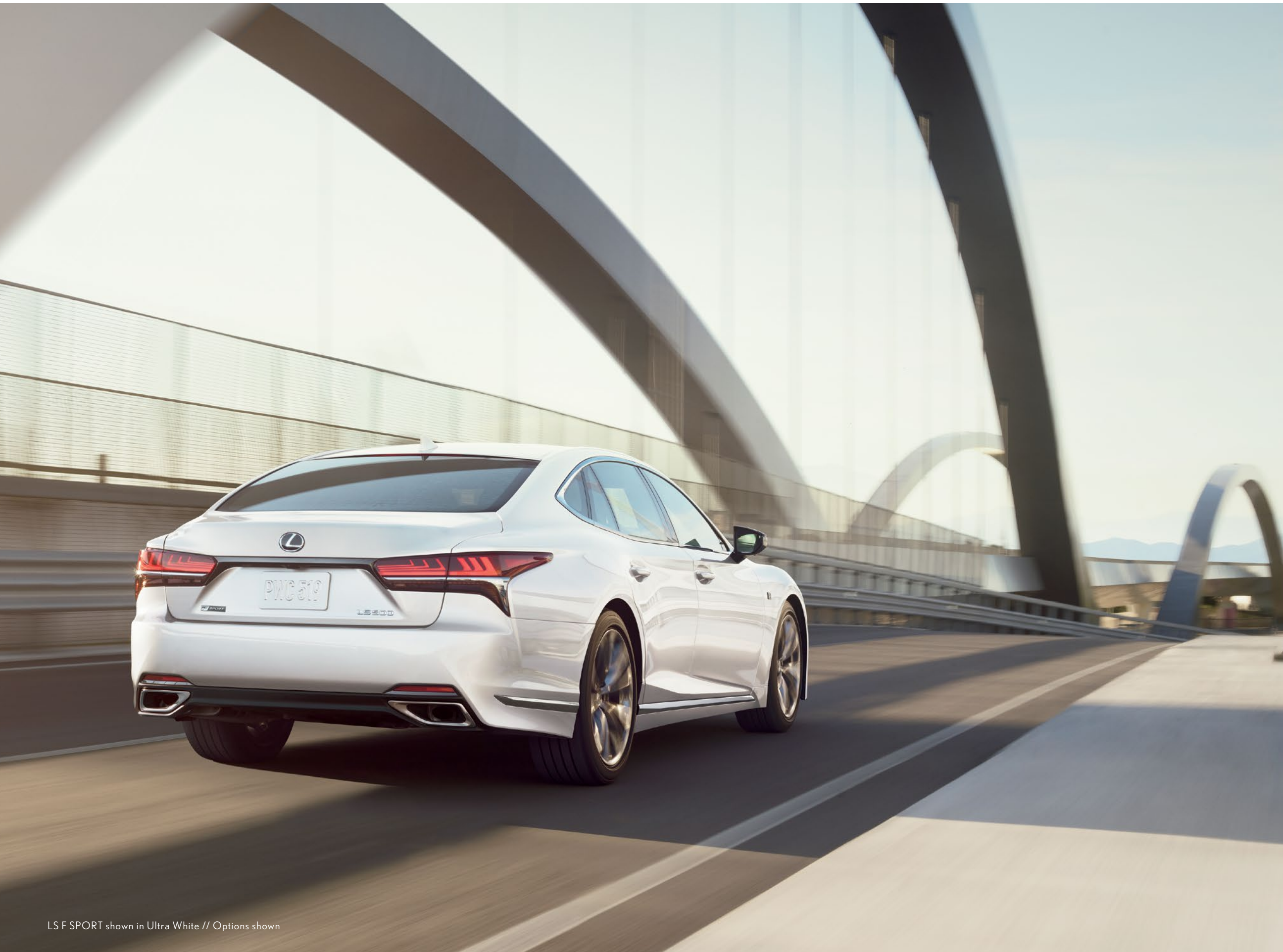
LS F SPORT shown in Ultra White // Options shown

The all-new 10-speed Direct-Shift automatic transmission is the first in its class, 3 delivering the optimal gear for a wide variety of driving conditions and offering paddle shifters for when you want control at your fingertips. It offers one of the fastest shift times among conventional automatic transmissions. 3 One of the most intelligent transmissions ever, it also learns with every drive and selects the optimum gear based on vehicle speed, acceleration and individual driving habits—even during cornering. This is performance technology designed to create a response from the car—and evoke one in the driver as well.