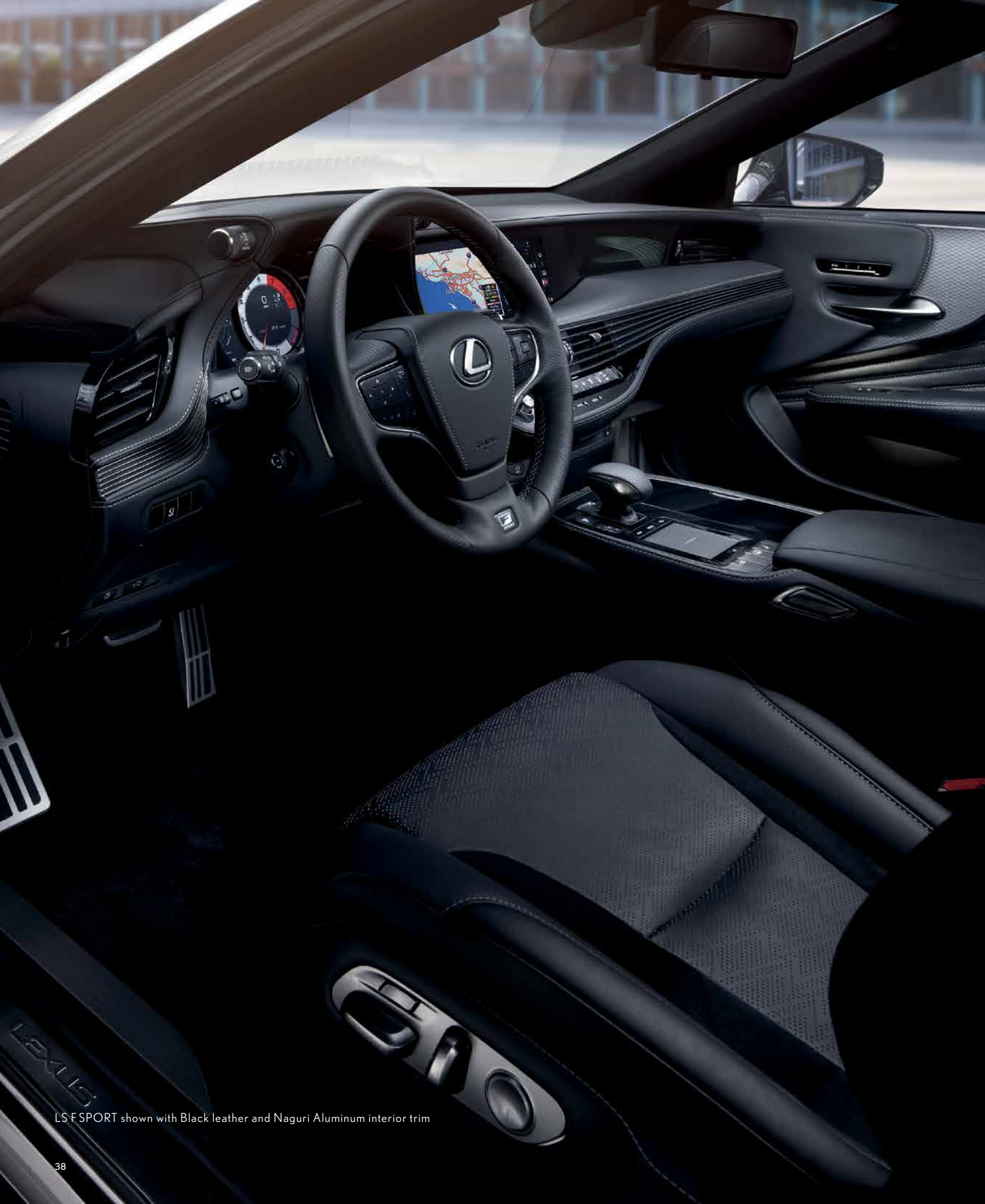
LS F SPORT shown with Black leather and Naguri Aluminum interior trim