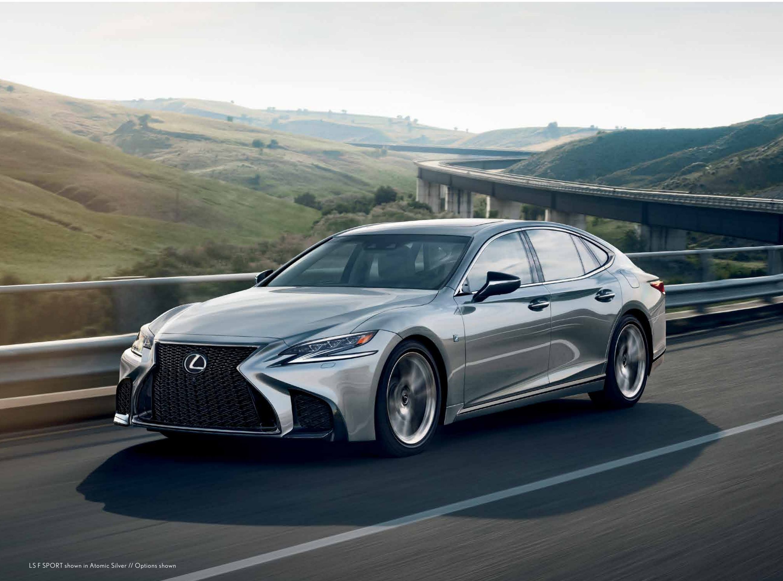
LS F SPORT shown in Atomic Silver // Options shown

The razor-sharp handling of the Lexus high-performance line meets aggressive, track-inspired design with the LS F SPORT. All LS F SPORT models share a platform with the intense LC coupe and share DNA with the LFA, including a specially tuned suspension system engineered by the same team behind the iconic supercar. The F SPORT also offers our most advanced vehicle dynamic control system—the world's first to control all six forms of vehicle movement. 3 And beyond larger brakes, high-friction brake pads 10 and deeply bolstered sport seats, you can take the exhilarating drive even further with the first-ever LS Performance Package, featuring Variable Gear-Ratio Steering, Active Rear Steering and active stabilizers.