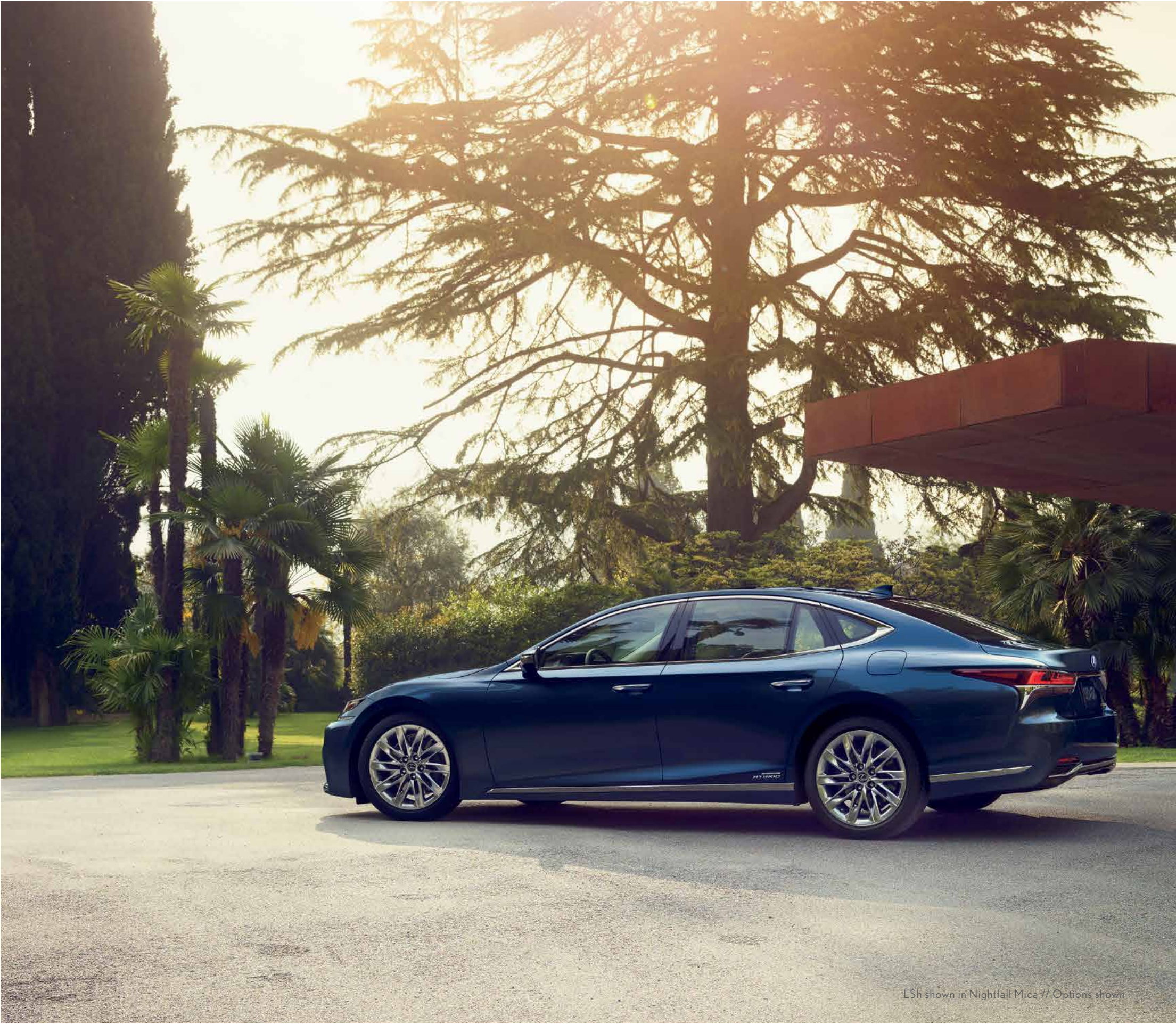
LSh shown in Nightfall Mica // Options shown

Split-five-spoke alloy wheels 11 with Dark Graphite finish STANDARD LS F SPORT