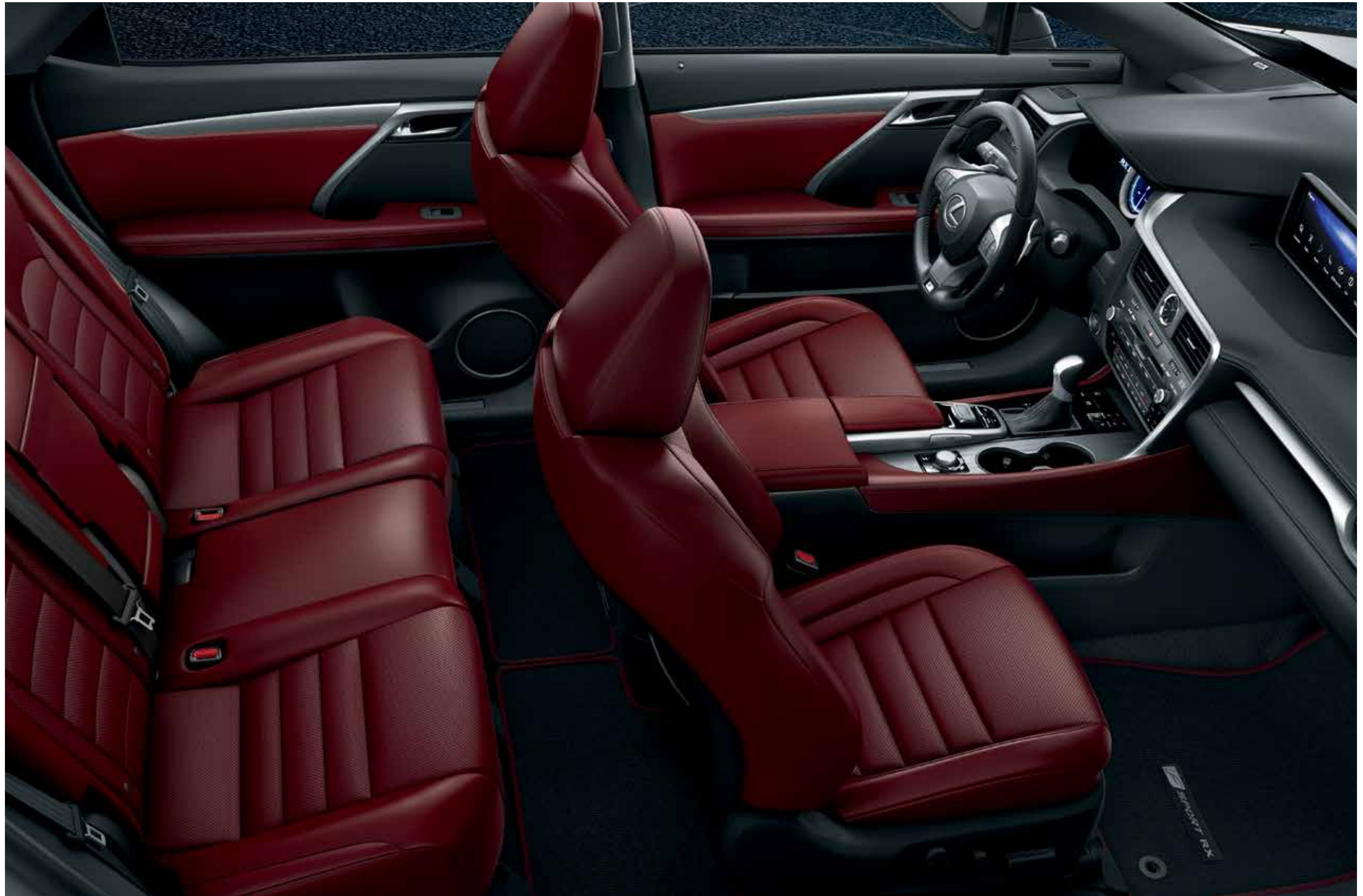
The cutting edge doesn't have to sacrifice comfort. The RX features 40/20/40-split rear seats, and offers heated and ventilated front seats.