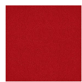
RED SEMI-ANILINE LEATHER*