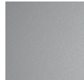
LIGHT GRAY SEMI-ANILINE LEATHER*