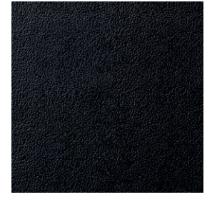
BLACK LEATHER or SEMI-ANILINE LEATHER*