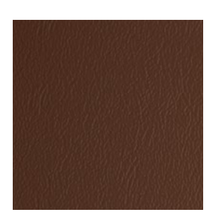
SADDLE SEMI-ANILINE LEATHER*