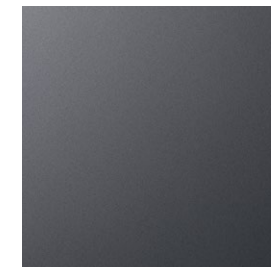
SILVER METALLIC FINISH**