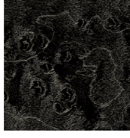
DARK GRAY BIRD'S-EYE MAPLE* BIRD'S-EYE MAPLE* FINISH