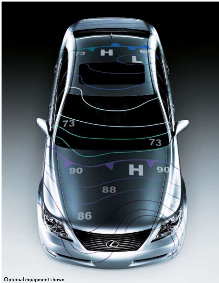
Optional equipment shown.